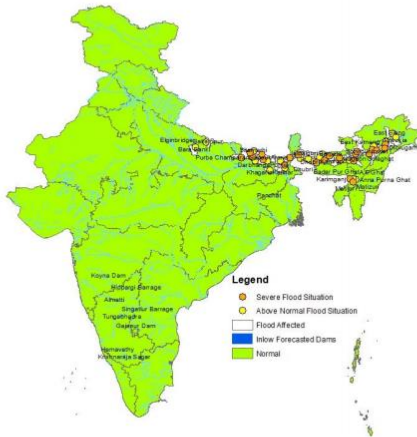
Flood Alerted marked as per IMD Rainfall Forecast for the next 5 days in various river basins