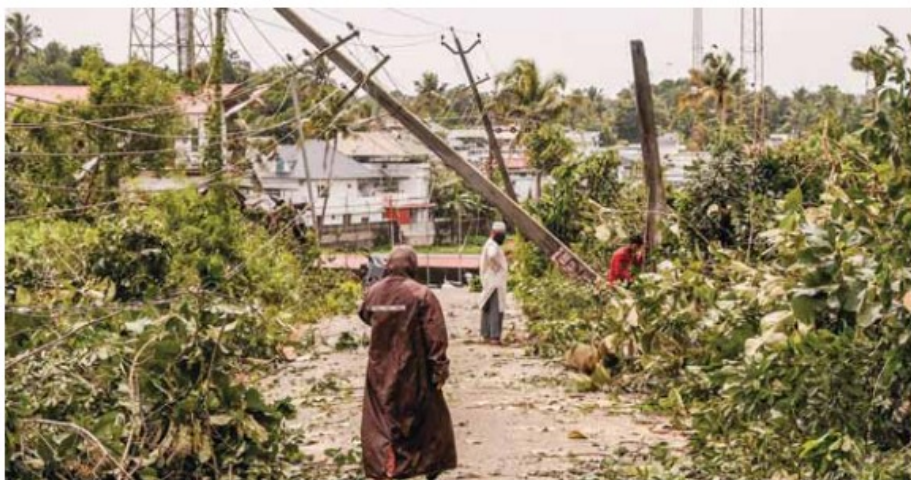
कोच्चि के इडायला में रविवार को भारी बारिश के बाद सड़क पर लटका हुआ एक बिजली का खंभा

कर्नाटक के कुछ हिस्सों में पिछले कुछ दिनों से भारी बारिश की वजह से काफी तबाही हुई है। खास तौर पर तटीय उडुपी जिला सबसे ज्यादा प्रभावित है जहां घर तथा फसलें पानी में डूब गई हैं, जिसके बाद सरकार ने रविवार को आपदा मोचन बल के कर्मियों को बचाव कार्य में लगाया है। कर्नाटक राज्य प्राकृतिक आपदा निगरानी केंद्र (केएसएनडीएमसी) के अधिकारियों ने बताया कि मलनाड, तटीय क्षेत्र और कुछ आंतरिक और उत्तरी जिलों में अगले कुछ दिनों में भारी बारिश के लिए अलर्ट जारी किए गए हैं। कर्नाटक में दक्षिणी पश्चिमी मानसून की दूसरी लहर राज्य से टकराई है जबकि कोविड-19 महामारी के बीच उत्तरी कर्नाटक में आई बाढ़ से राज्य अब तक ठीक से उबर भी नहीं था। केएसएनडीएमसी ने रविवार को बताया कि उडुपी में स्थिति गंभीर है क्योंकि कुछ गांव पानी में डूब चुके हैं, घर गिर गए हैं, सड़कें बह गई हैं और खेतों में लगी फसलें पूरी तरह से बर्बाद हो गईं। उडुपी में जिला मुख्यालय नगर में भी कई घर, चार-पहिया वाहन