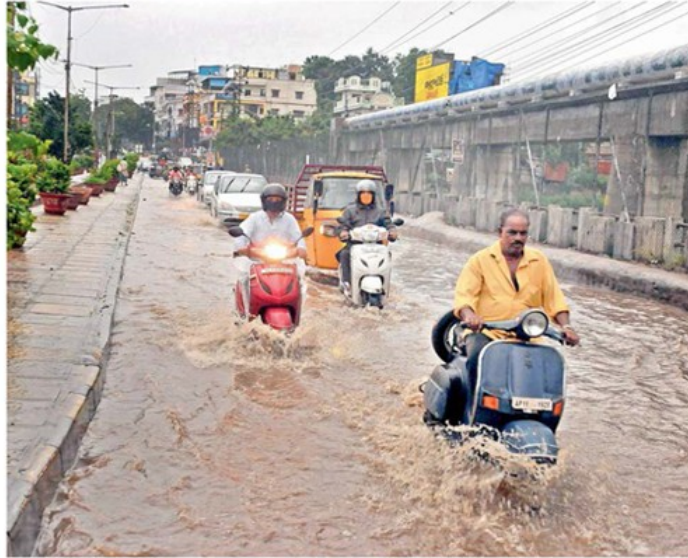
The road at Moosarambagh is waterlogged Due to the heavy rain on Sunday, making it difficult for motorists to traverse the stretch. — P. SURENDRA

As a result, officials of the state government said there are chances of flood-