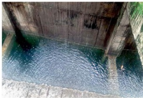
The flooded basement of the under-construction Garden View Wakf mall in Hyderabad.

The lower of the two basement levels was flooded a month ago and no steps were taken to clear the water. The upper level was inundated following the recent rains. The flooding of the basement, it is feared, could pose additional danger to