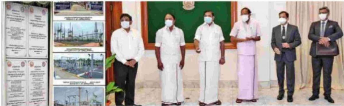
Chief Minister Edappadi K Palaniswami inaugurating 25 sub-stations of TNEB from the Secretariat in Chennai on Saturday