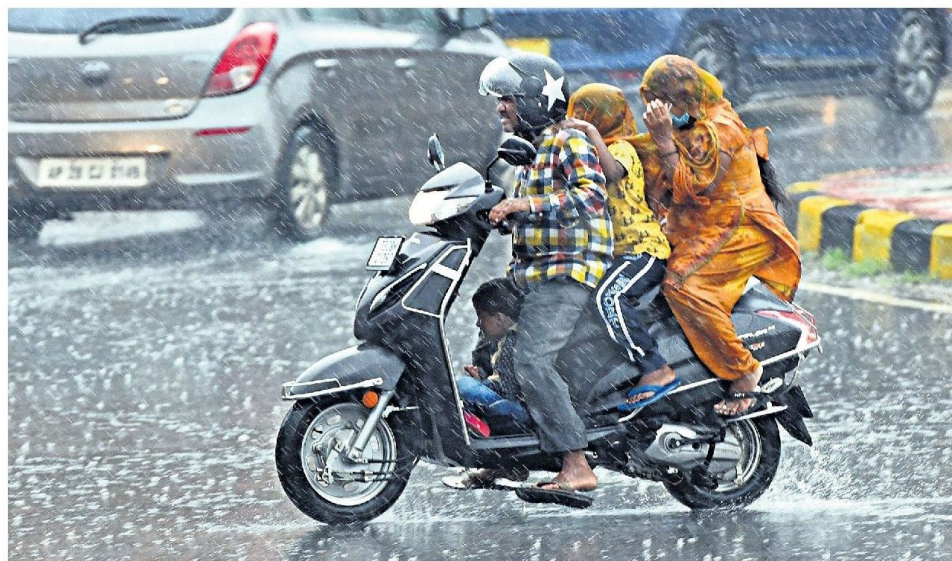
A scooterist, along with his family, rush for cover as rains lash Hyderabad on Sunday. The South West Monsoons have been relentless in Hyderabad and elsewhere in Telangana for the past few days.

In the State, maximum rainfall of 86.5 mm was recorded at Madgul near Rangareddy district while highest temperature of 37.7 has been registered at Manthani in Peddapalli. The weathermen attributed prevailing weather conditions to the low pressure area over northeast Bay of Bengal and neighborhood with associated cyclonic circulation and under its influence, rainfall distribution and intensity is expected to increase over the State in the next two days. The weather forecast with TSDPS shows