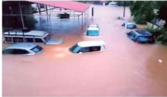
Under water: Vehicles submerged in a flooded area in Kalsanka near Udupi Krishna Mutt.

Floodwaters from the overflowing Indrani rivulet at Kalsanka in Udupi city entered the Rajangana on Sri Krishna Math premises. The entire parking area of the