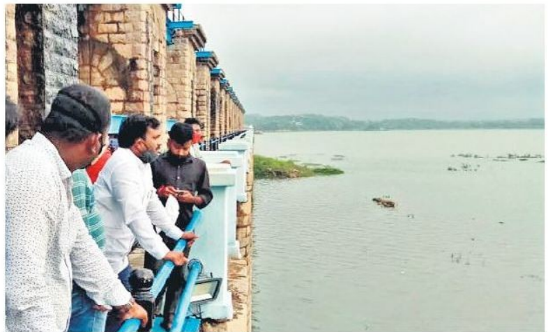
People throng Himayat Sagar following the increase in water levels, in Hyderabad on Sunday.

This was after the water levels increased by 1.3 ft in Himayath Sagar and by 2.2 ft in Osman Sagar. On Thurs-