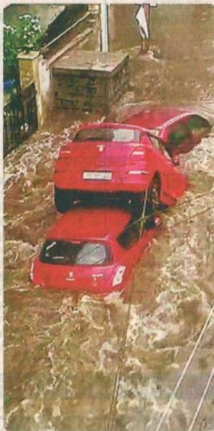
हैदराबाद के न्यू बोलोनपल्ली में एक-दूसरे पर चढ़ी कारें।