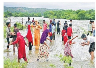
Children play in the waters downstream of Himayat Sagar after the gates were lifted to release water following heavy inflows.

At 6 pm on Wednesday, the inflows receded to 8,500 cusecs and the outflows were 10,290 cusecs. The current water level in the reservoir is 1763.20 ft against the Full Tank Level of 1763.5 ft.