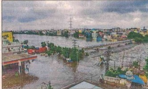
A submerged cable bridge in Hyderabad on Wednesday

In Andhra Pradesh, heavy rains triggered by the