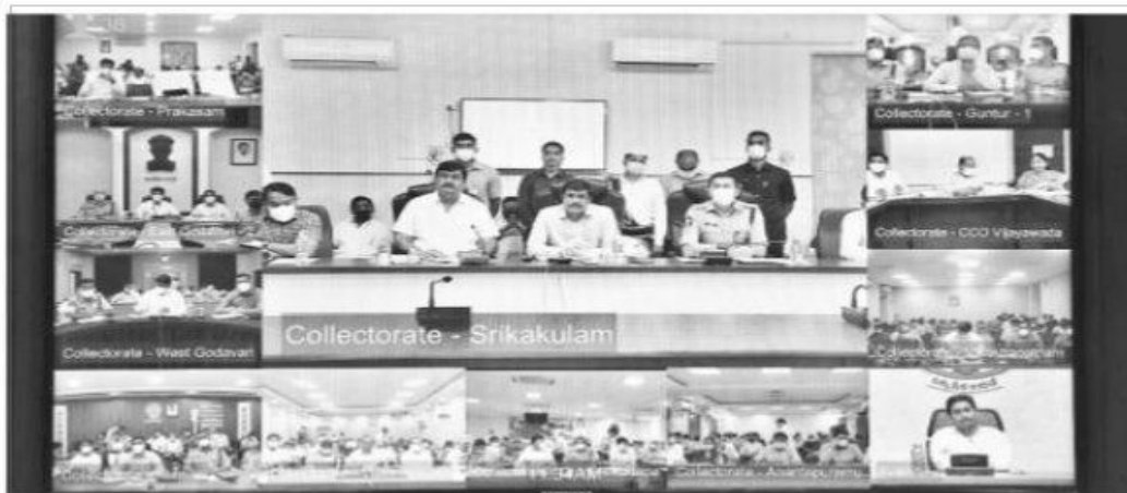
Chief Minister Y S Jagan Mohan Reddy interacting with District Collectors and SPs on rains and floods from his camp office in Tadepalli on Wednesday