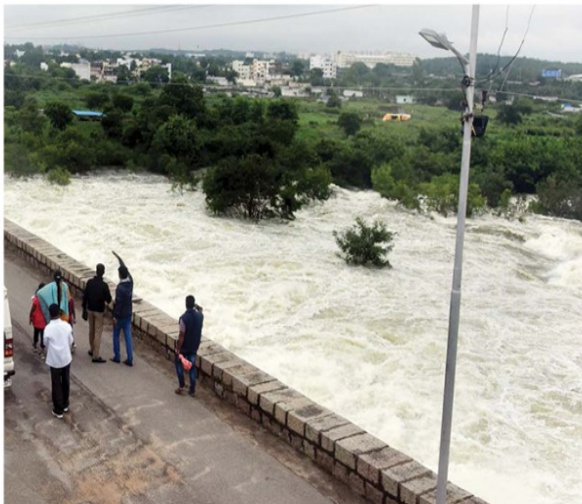
People throng the Himayatsagar reservoir where the gates were opened on Wednesday following heavy inflows from the catchment areas. — R. PAVAN