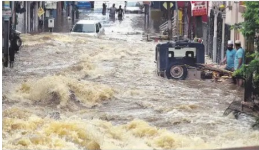
RAIN MAYHEM: Vehicles stuck on a flooded road in Hyderabad on Wednesday.