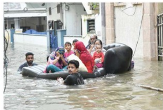
Top: Cars got drowned following heavy rains in Nadeem Colony while (below) people from the same colony were rescued as their houses got flooded due to heavy rains in Hyderabad on Tuesday and Wednesday.