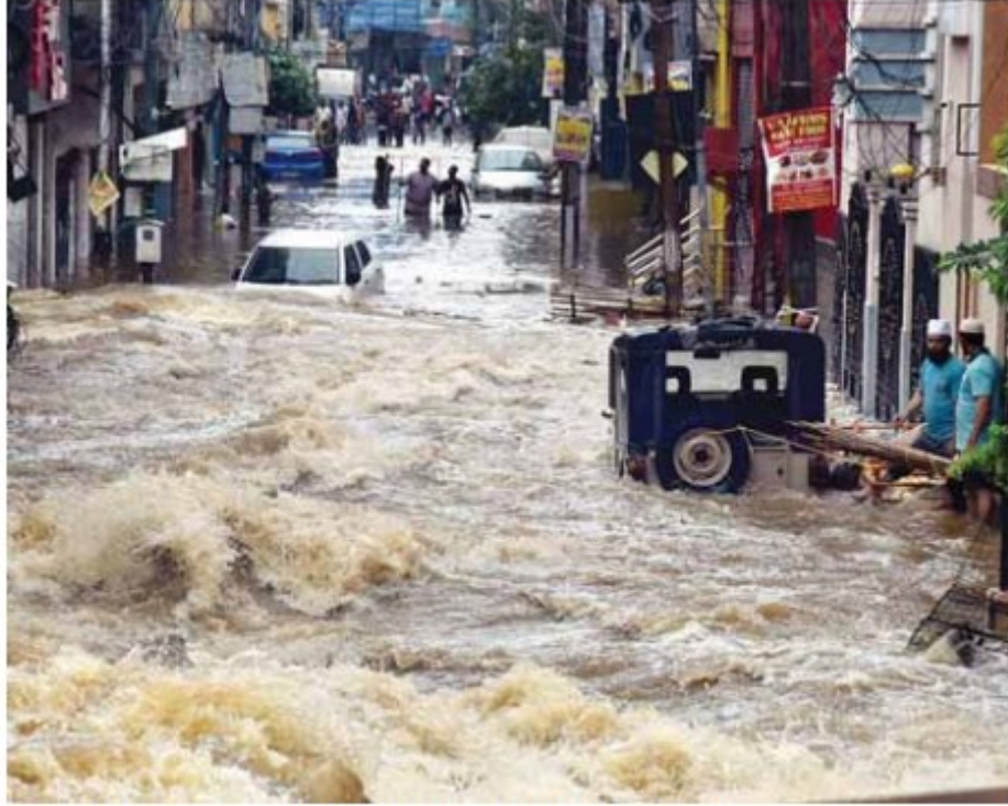
Floodwaters gush through a street following heavy rain at Falaknuma in Hyderabad on Wednesday