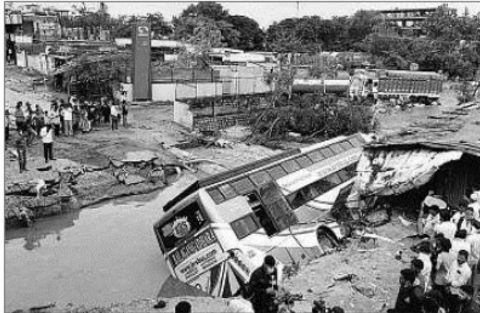
A bus fell into a drain after a part of the Gaganpahad-Shamshabad road, near Hyderabad, caved in on Wednesday following incessant rain. PTI

DCP Shamshabad N Prakash Reddy confirmed to The Indian