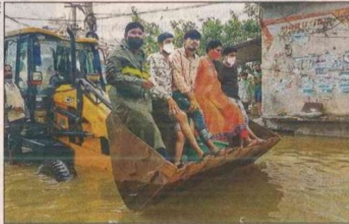
A rescue operation being carried out to shift residents from the flooded Singareni Colony Hyderabad on Wednesday

The city reported at least 18 deaths, but sources said the toll could rise given that there were a number of instances of