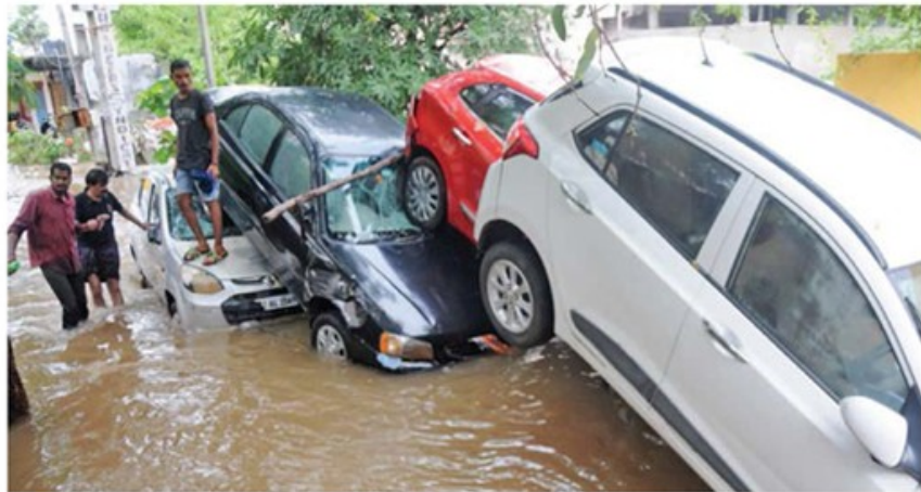
People struggle to remove four cars that piled on one another at Saroornagar in Hyderabad as they drifted away from the place they were parked unable to withstand the water current following incessant rains on Wednesday.

Tuesday's rain was the highest the city had got in the last 117 years, the India Meteorological Department said Wednesday. The record for the highest 24-hour rainfall in the city was on October 6, 1903, when it had received 117.1 mm of rainfall. On