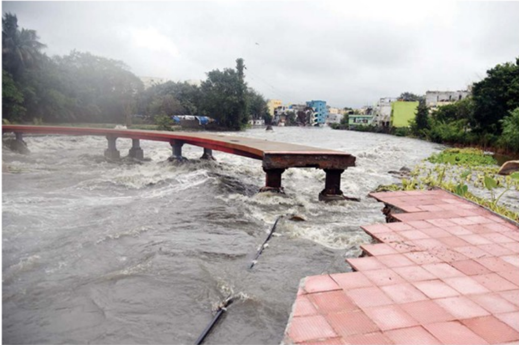
A newly constructed park along a nala (drain) was washed away at Begumpet in Hyderabad as it could not withstand the heavy rains in the city on Wednesday. —S. SURENDER REDDY