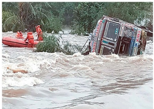
After the heavy rains, police and NDRF teams rescue driver of a washed away lorry in Peddamberpet on Wednesday.

In Chikoti Gardens, links to several localities were cut off due to major inundation. The Brindavan society, consisting of approximately 100 flats, was submerged in over 10-foot-high stormwater on Wednesday morning, with cars in its cellar completely overrun by water. The road to Holy Trinity church was also cut off. The church was also surrounded by high water levels after the heavy rains.