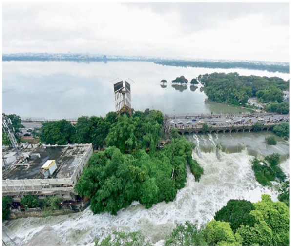
Water gushes out of the Hussainsagar lake as its gates were opened following incessant rains in Hyderabad on Wednesday. The full tank level was crossed on Tuesday.