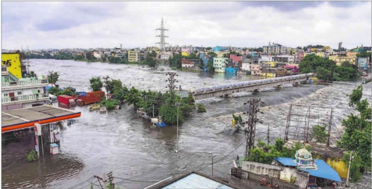
Durgam Cheruvu cable bridge submerged under floodwater following heavy rain in Hyderabad on Wednesday.