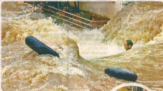
हैदराबाद के फलकनुमा में पानी के बहाव में बहते एक शस्त्रा को बचाने के लिए लोगों ने हवा भरी ट्यूब फेंकी, ताकि वह उसे पकड़ कर डूबने से बच जाए।