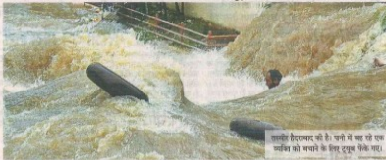
साथीर हैदराबाद की है। पानी में बह रहे एक व्यक्ति को बचाने के लिए ट्यूब पेंके गए।

नई दिल्ली/हैदराबाद | आंध्र प्रदेश, केरल समेत दक्षिण के कई राज्यों में बारिश अफसत बनकर टूट रही है। तेलंगाना के हैदराबाद में खे बाढ़ जैसे हालात बन गए हैं। हैदराबाद के लोगों ने पिछले 20 सालों से ऐसी मुसलाधार बारिश नहीं देखी है। सड़कों और निचले इलाकों में पानी भर गया। पानी का बहाव इतना तेज था कि सड़क पर कारें तैरती हुईं। नगर अर्द्ध-बंदराना कालों में बारिश सेहान का दुकड़ा भिरने से बच्चे समेत 9 लोगों की मौत हो गई। तेलंगाना व आंध्र में बुधवार रात तक 21 लोगों की जान जा चुकी है। लोगों को घरो में रहने को कहा गया है। सरकार ने वर्क प्रोग होम की परबवइजरी के साथ गुरुवार तक छुट्टी घोषित कर दी है।