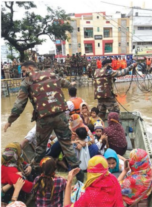
The Army launched flood relief and rescue columns in Bandlaguda area on requisition by the state government. Many stranded people were evacuated and a large number of food packets distributed were distributed on Wednesday.