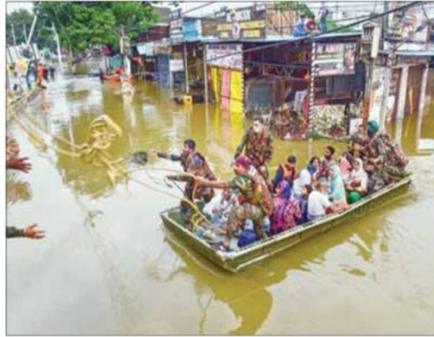
Rescue operation being carried out for locals to move them to safer places following heavy rain, at Al Jubail Colony in Hyderabad, on Wednesday

The recent rain-related damage is the third such instance in the past four months. Certain regions had twice suffered floods in August and September. Things were worse in parts of Telangana where incessant rainfall led to water-logging.