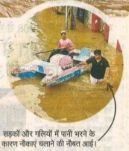
सड़कों और गलियों में पानी भरने के कारण नौकाएं चलाने की नौबत आई।

व मराठवाड़ा में भारी से अति भारी बारिश की संभावना जताई है। उत्तर प्रायद्वीपीय भारत व उससे सटे गुजरात, प. छत्ता, मध्य और पूर्वी भारत में छिटपुट वर्षा का अनुमान है। पूर्वी राजस्थान, य. उत्तर प्रदेश, पूर्वोत्तर और द. प्रायद्वीपीय भारत में अलग-अलग बारिश हो सकती है। बाकी हिस्सों में शुष्क मौसम की संभावना है।