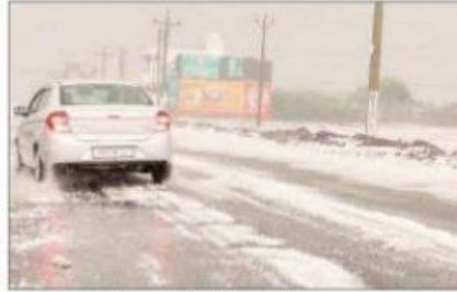
हरियाणा के हिसार में ओले पड़ने के बाद का नजारा।

भारतीय मौसम विभाग ने बताया है कि हिमाचल प्रदेश में मौसम ने करवट बदल ली है। रविवार सुबह से ही लाहुलस्पीति व कुल्लू मनाली की ऊंची चोटियों में बर्फबारी का क्रम शुरू हो