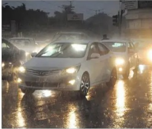
Commuters drive amid rain in Jalandhar on Sunday.