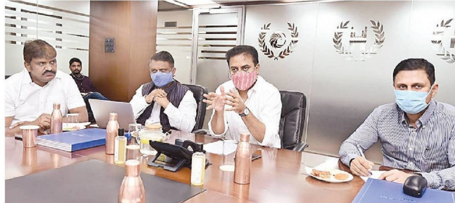
Municipal Administration Minister KT Rama Rao holding a review meeting with the Irrigation, Water Board, HMDA, Revenue officials at GHMC office in Hyderabad on Sunday

The Minister held a review meeting with the irrigation, Water Board, HMDA, Revenue officials at GHMC office on Sunday. He said that the government was taking up a special action plan for