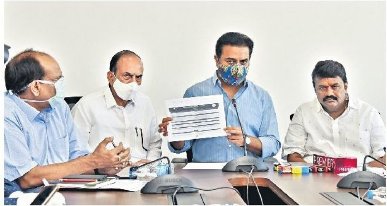
Minister KT Rama Rao speaking at a press meet on Sunday.

"It was decided that some more help should be extended to the people. Accordingly, the Chief Minister asked us take necessary measures to give more relief to the affected," the Minister said. The Minister said the