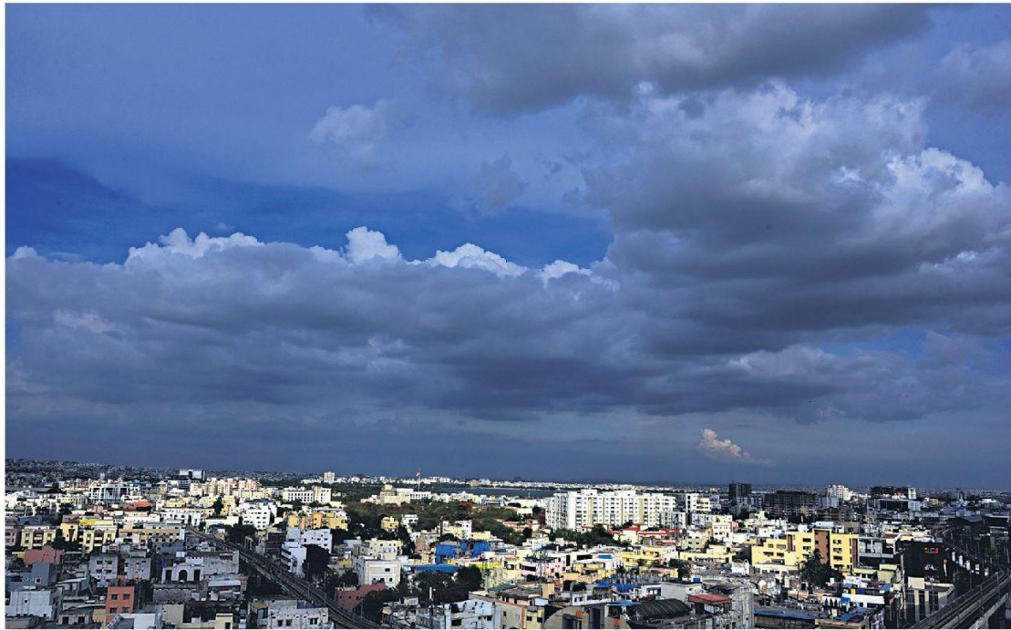
Rains lashed several localities in the city due to the effect of cyclone Tauktae, on Sunday.