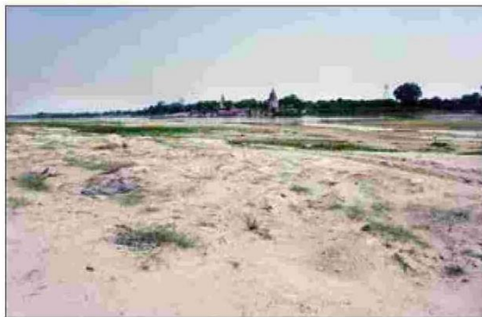
More than 300 bodies found buried near Ganga in Shivrajpur, Kanpur on Friday