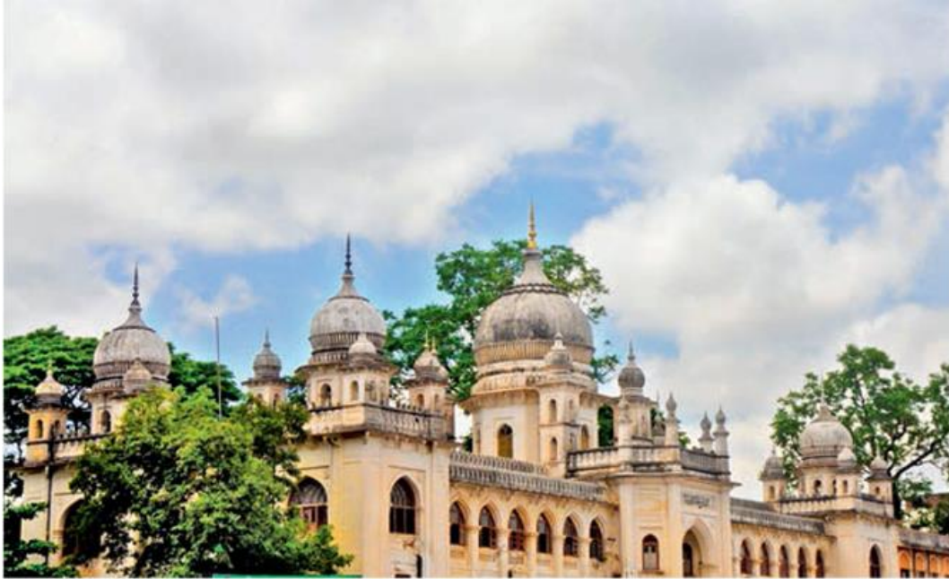
With the city witnessing rains for the past few days, thick clouds form in sky over the Unani Hospital in Hyderabad on Sunday.