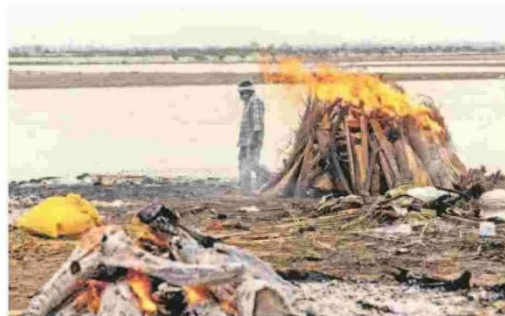
States have been asked to give financial aid for cremation.

“Instructions already given and wanted expeditious action