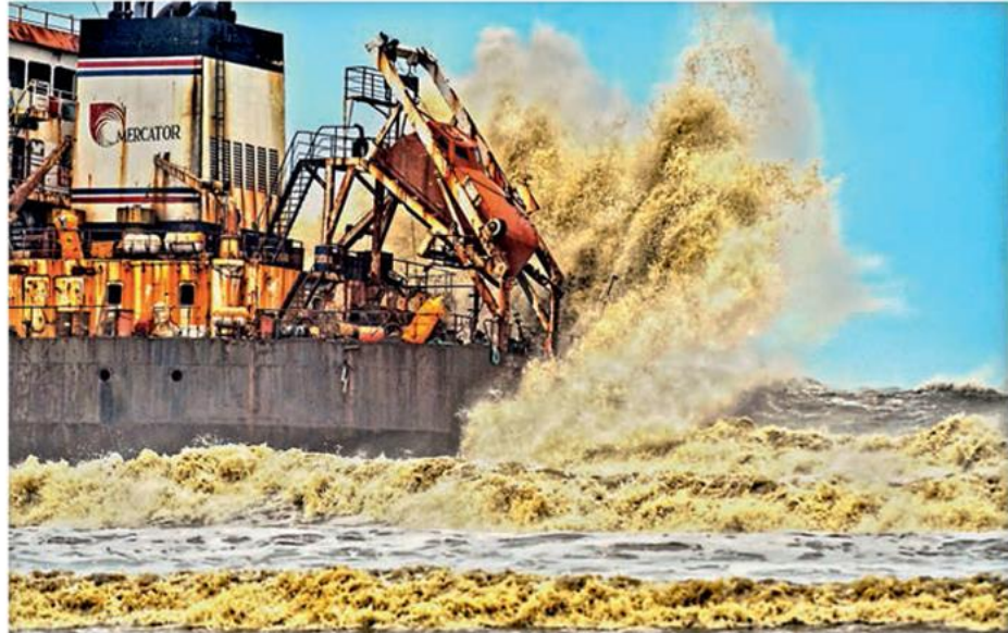
High sea waves due to Cyclone Tauktae hit the Bhagavathi Prem, a sunken dredger, at the Surathkal Beach near Mangaluru in Karnataka on Sunday.

Four deaths have been reported from Karnataka's