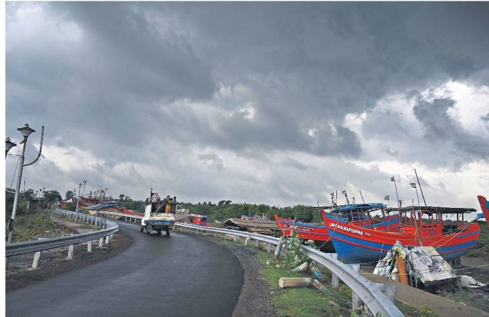
Dark clouds loom over fishing boats moored as cyclone Yaas barrels towards eastern coast in the Bay of Bengal, in Digha some 190 km from Kolkata on Tuesday.

She said that National Disaster Response Force (NDRF) and State Disaster Response Force (SDRF)