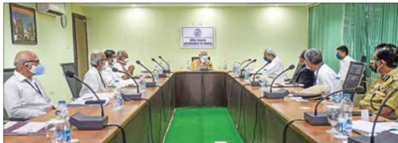
PM Modi chairs a meeting with Odisha CM Pattanaik to review the impact of Cyclone Yaas in Odisha

The central government will also deploy an inter-ministerial team to visit the Yaas affected states to assess the extent of damage, and further