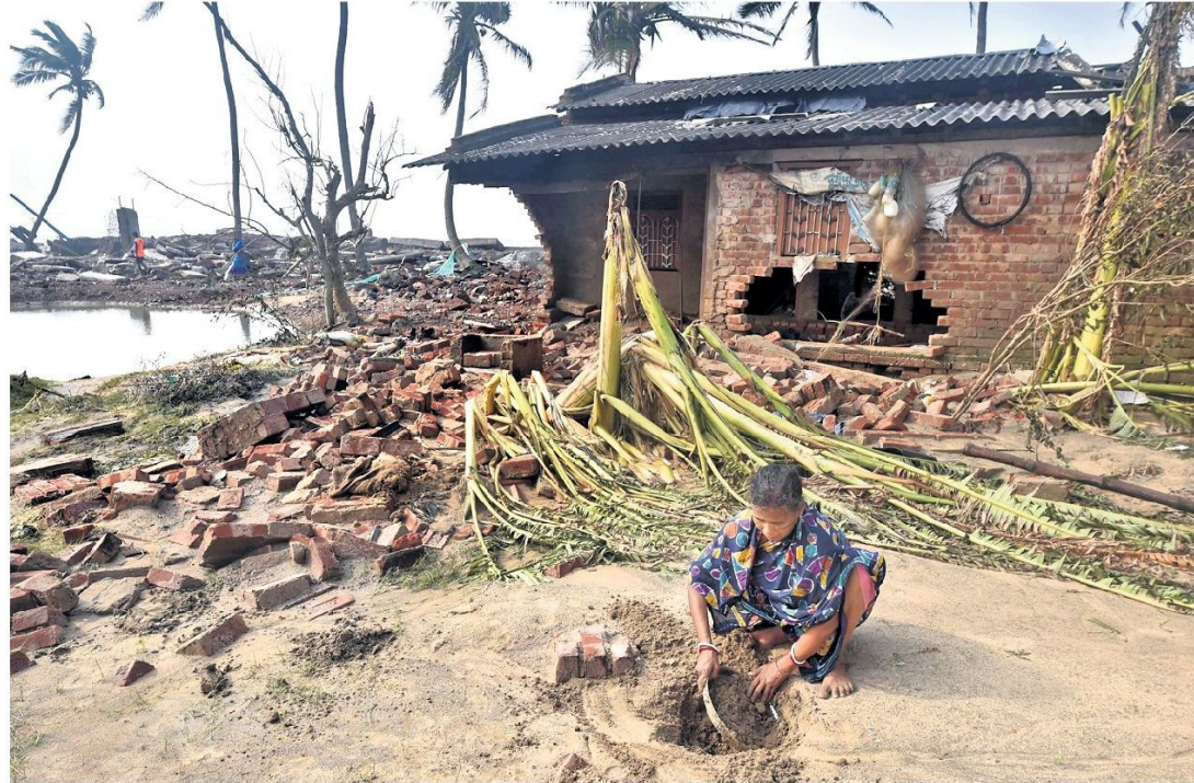
A woman digs the soil to look for her utensils buried outside her house, in the cyclone-affected area of Shankarpur beach in East Midnapore, on Friday.

The central government will also deploy an inter-ministerial team to visit the Yaas affected states to assess the extent of damage, and further assistance will be given to them based on the report of the team. Modi also announced ex-gratia of Rs 2 lakh to the next of kin of each deceased and Rs 50,000 to each of the seriously injured in the cyclone. While three people including a