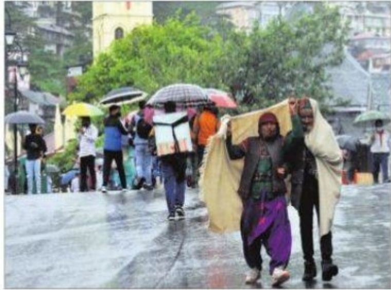
Commuters walk during rainfall in Shimla on Monday.

Moderate to very heavy rain lashed several parts of the state. Palampur with 245 mm of rain was the wettest followed by Dharamsala 119 mm, Bilaspur 104 mm, Mandi 86 mm, Hamirpur 77 mm, Paonta Sahib 72 mm, Una 71 mm, Dalhousie 69 mm, Nahan 68 mm, Solan 64 mm, Nalagarh 39 mm, Kufri