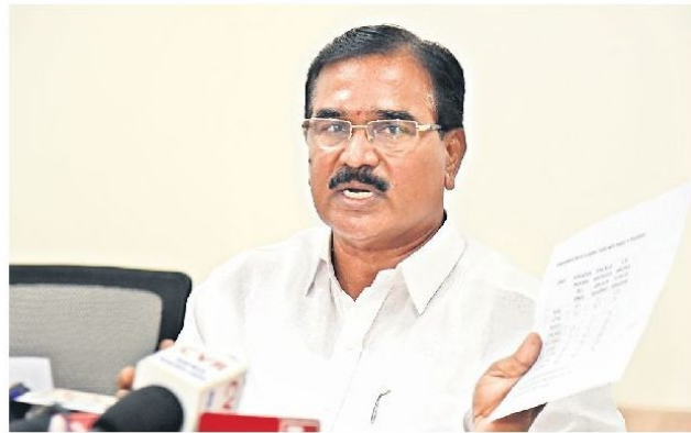
Agriculture Minister S Niranjan Reddy addressing mediapersons in Hyderabad on Monday.

"This is a life and death problem for people of Telangana whose fight for a separate State was rooted in discrimination in river water sharing. Telangana will not accept such unilateral and unconstitutional decisions of the Central government. But if the Centre decides to force its deci-