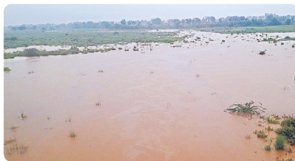
अलवर. साहबी नदी में करीब 21 साल बाद आया पानी।