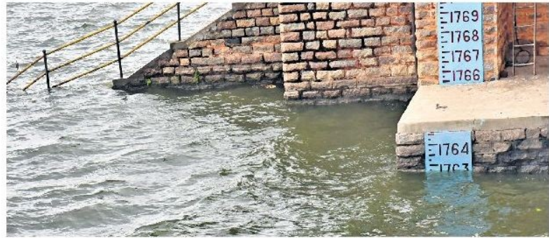
On Monday evening, the water level at the reservoir was recorded at 1,762.60 feet against the FTL of 1,763.50 feet.

It was after a decade that the gates of the reservoir were opened twice in October 2020 following floods. Authorities were planning to open the gates if the rains continued. Residents in downstream areas of Bandlaguda and Sun City Colony were also alerted about the same. With the dip in inflow, the need to open the gates