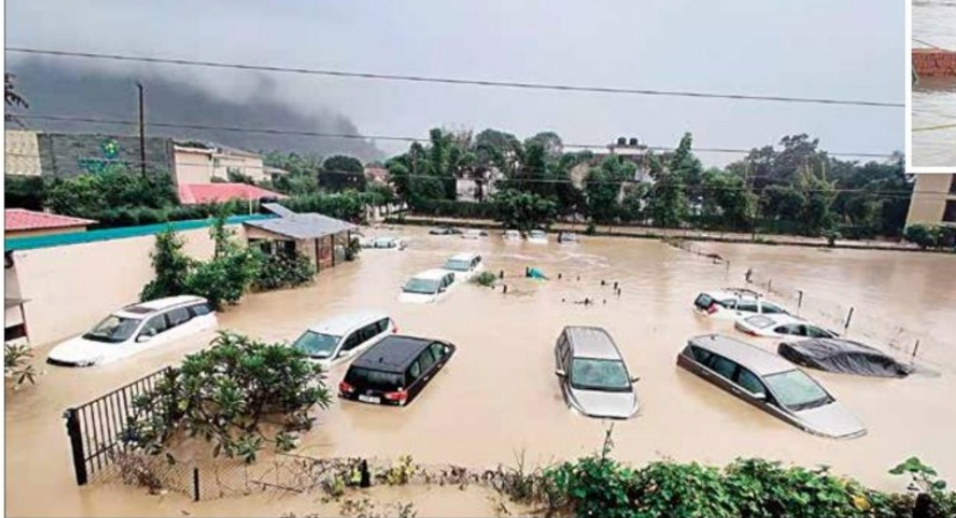
Submerged cars are seen at a flooded hotel resort as extreme rainfall caused the Kosi River overflow at the Jim Corbett National Park in Uttarakhand, on Tuesday

» An Orange alert has been issued for all districts in Kerala other than Kannur & Kasaragod on October 21