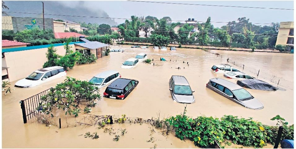
Cars submerged at a flooded resort at the Jim Corbett National Park in Uttarakhand.