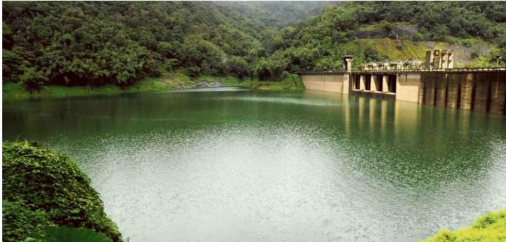
The Idamalayar dam is constructed across a major tributary of the Periyar in Ernakulam district.

Project to remove silt deposited after 2018 floods yet to take off