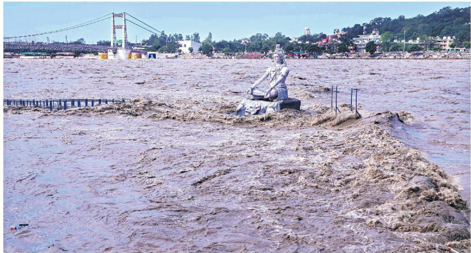
Ganga river engulfs a giant statue of Lord Shiva in Rishikesh in Uttarakhand, on Tuesday.

On Tuesday, Dhami reviewed the situation in Nainital after reports that many parts of the district are cut off for road traffic. Due to excessive rain, the road in Golapar area of Kathgodam was washed away in the river. Train movement has also been affected in Kathgodam. Many trains have been either cancelled or terminated before the final destination. The Chief Minister directed the