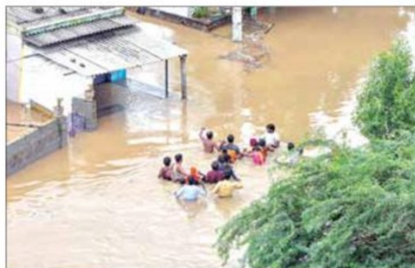
Residents wade through a flood-affected area in Nellore district of Andhra Pradesh

The State Disaster Management Authority said more than two lakh cusecs of floodwater flowed out of the Somasila reservoir in SPS Nellore district, leading to the deluge. This caused breach of the National