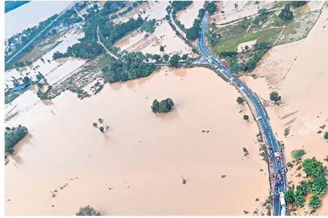
Vast swathes of land under water in Kadapa district of AP.

The flash flood caused due to a breach of the project's earthen bund caught at least 18 people in a watery grave and left many others missing in these villages. A sudden gush of about two lakh cusecs of floodwater on Friday, with the level reach-