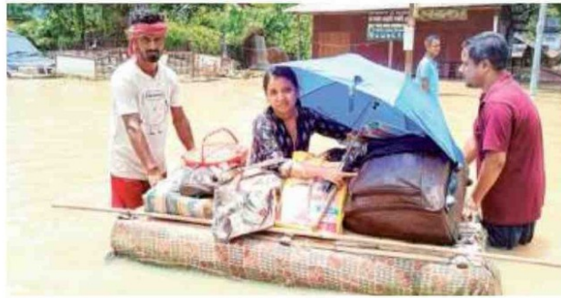
A woman protecting her baby from the sun as they move to higher ground in Silchar on Sunday.

The Chief Minister said the culprits who left a gaping