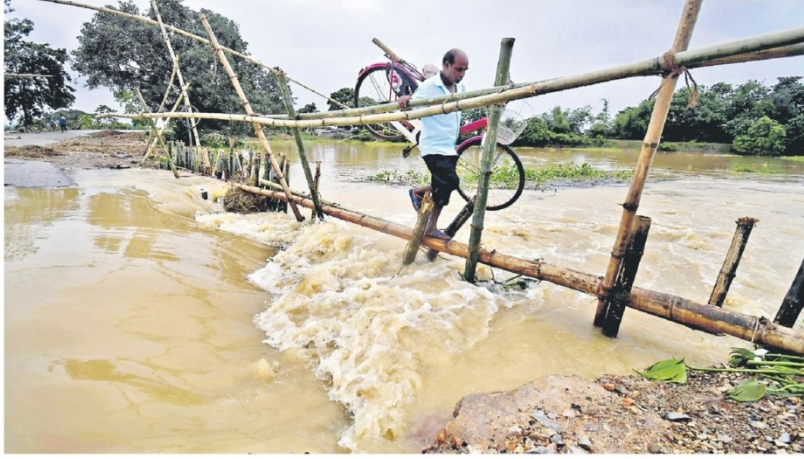
A man crossing a washed away road using a temporary bamboo bridge in Nagaon district of Assam.

Besides, two are missing in two districts, it said. The total number of people losing lives in this year's flood and landslides in the state has now gone up to 126. The bulletin said over 22,21,500 people were hit due to