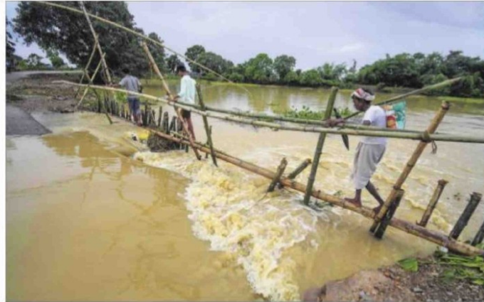
Villagers make a temporary bamboo bridge after a portion of a road was washed away due to flood following heavy rainfall at a village in Nagaon, Assam, on Sunday.