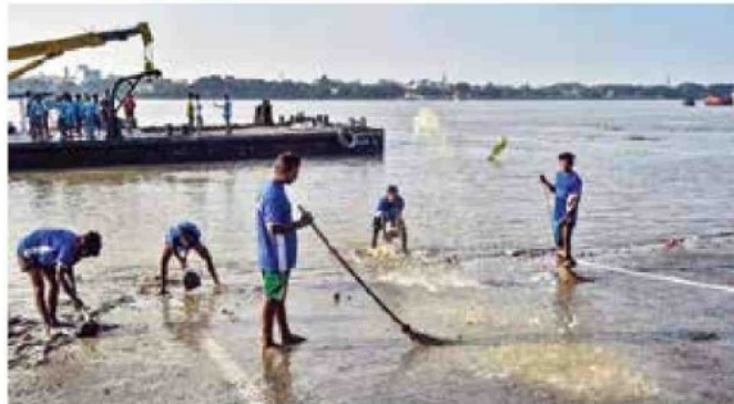
Municipal workers clean the ghat on the banks of River Ganga to prevent pollution

For sewerage management, four projects in Uttar Pradesh were approved, including tapping of Assi drain in Varanasi by constructing a 55 MLD Sewage Treatment Plant (STP), and other works costing Rs 308.09