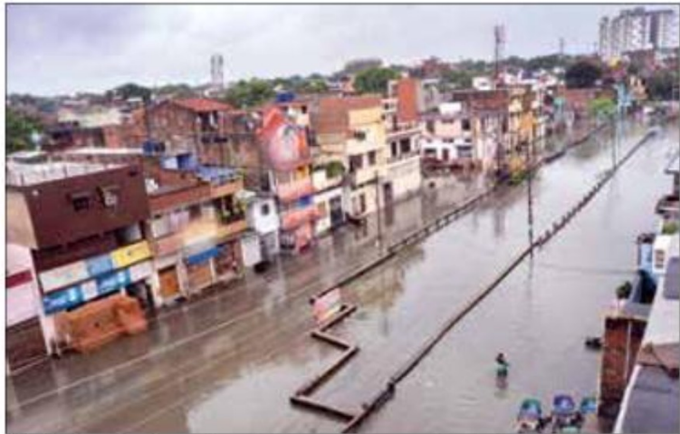
Flooded roads along the Tilak Nagar Sisamau drain following heavy downpour, in Kanpur on Monday