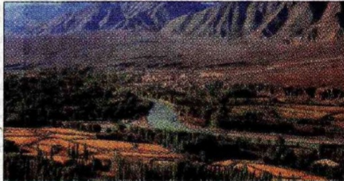
The Indus flows through Leh in the Ladakh region. FILE

"It was noted that progress had been made on several fronts and emphasis was laid on completing the works on all the Indus basin projects in a timely manner to enable better utilisation of India's rights