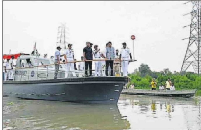
Delhi LG VK Saxena and senior officials went on a boat ride on the Yamuna on Tuesday afternoon.

After the inspection, Saxena said, "Cleaning works on the 11km stretch of the river till the ITO barrage had been successfully completed recently and is there for anyone to see. Any long-term solution to the rejuve-