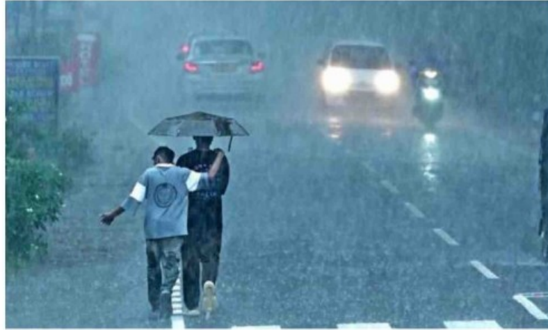
Bouncing back: Heavy rain lashed Kottayam on Tuesday. After deficit rainfall in June in many parts of the country, the monsoon made a strong comeback in the State in July. VISHNU PRATHAP