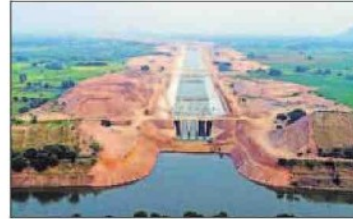
Panel pointed out lapses in the operation and maintenance of the Kaleshwaram project.

reaction from the state government or the BRS on the report, party working president and state minister K T Rama Rao on Thursday said the barrage withstood the last five flood seasons. "The contracted agency will bear the cost of any repair," he said.