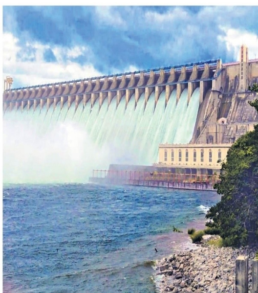
The BRS had consistently been making a strong case with regard to the injustice meted out to the State with the sharing of Krishna river water between TS and AP at a 34:66 ratio.