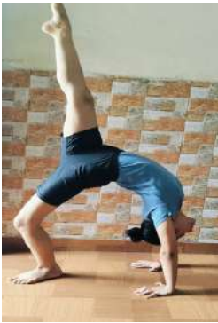
EK PADA CHAKRASANA