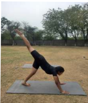
EK PADA SHVANASANA