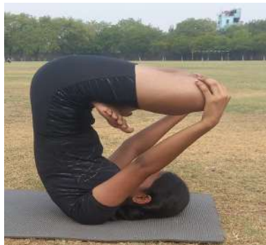
URDHAV PADAM SARVANGASANA