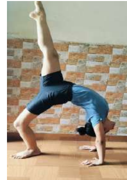
EK PADA CHAKRASNA