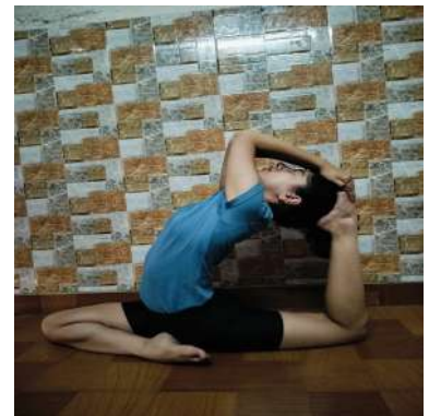
EK PADA RAJKAPOTASANA