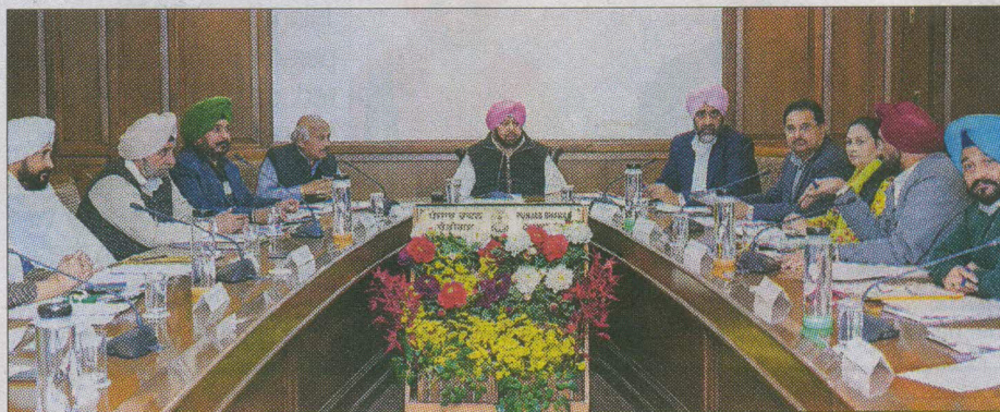
Chief Minister Capt Amarinder Singh chairs the Cabinet meeting in Chandigarh on Wednesday.

Water Resources Minister Sukhbinder Singh Sarkaria, in a statement, said the proposed regulatory architecture had been carefully crafted through multiple iterations. It has been structured to provide functional autonomy to the regulator on the one hand,