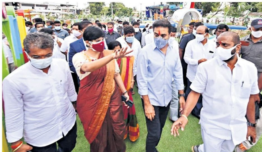
MA&UD Minister KT Rama Rao at Pattana Pragathi programme in Narayanpet on Saturday.

Participating in the Pattana Pragathi programme here on Saturday, the Minister said there was a public hearing scheduled on August 10 regarding land acquisition for the Palamuru Ranga Reddy Lift Irrigation project. "There are a few people who will create hurdles for welfare and devel-