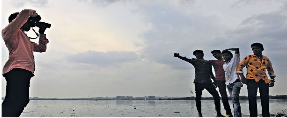
Youngsters pose on a breezy Saturday at Hussain Sagar.