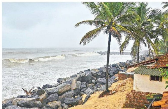
A view of Ullal beach as monsoon approaches Mangaluru on Sunday

By Sunday, monsoon has covered the entire Odisha, West Bengal, Jharkhand, Bihar, Jammu and Kashmir, Ladakh, Gilgit-Baltistan and Muzaffarabad and some parts of Haryana, Chandigarh and northern Punjab, covering nearly 80 per cent of the country's geographical area. The India Meteorological Department (IMD)