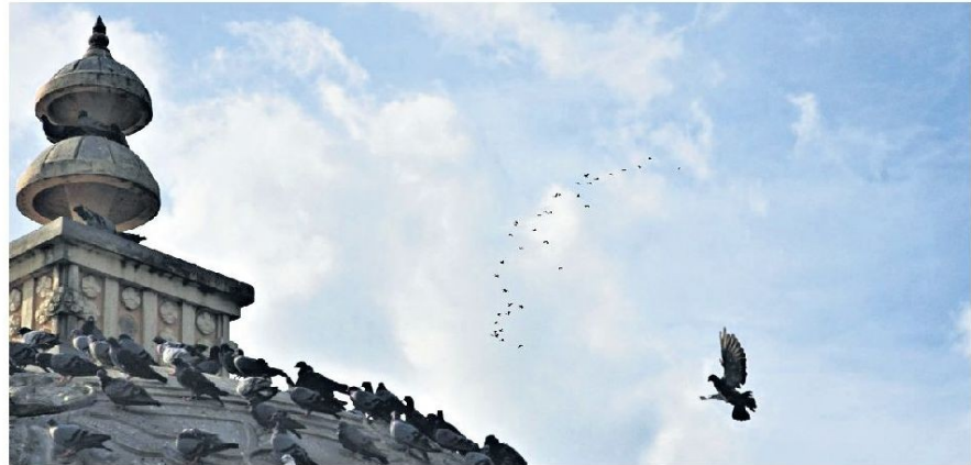
According to IMD, there will be moderate rain in Hyderabad for a couple of days.

"There will be moderate rain in Hyderabad for a couple of days due to the east-west trough from the cyclonic circulation across