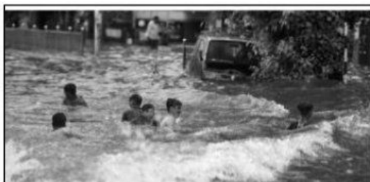
Children play on a waterlogged street after heavy rain, at Sion in Mumbai on Saturday.

India Meteorological Department (IMD) had issued a thunderstorm warning for a few districts in Konkan region, including Mumbai, for the next three hours from that time.