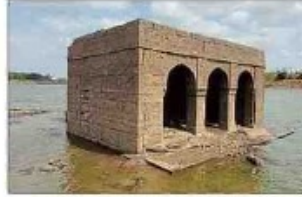
A temple submerged in River Krishna has surfaced following depletion of water level, near Banhatti of Gadag district.

The inflow to the dam has stopped completely for the last two days. The outflow was limited to 300 cusec but in the last few days it has increased to 1,075 cusec. The dam authorities are releasing the said quantum of water to Ganekal reservoir in Raichur district to meet drinking water needs of the region. "The considerable dip in the water level in Tungabhadra reservoir may trigger a severe drinking water crisis in Vijayanagara, Ballari, Koppal and Raichur districts. As of now, there is no shortage of drinking water in Vijayanagar district. But further delay in monsoon will only worsen the situation. If such a situation arises, we will use water from the dead storage, Vijayanagara Deputy Commissioner Venkatesh T told DH .