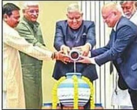
विज्ञान भवन में राष्ट्रीय जल पुरस्कार समारोह की शुरुआत करते उपराष्ट्रपति और अन्य।

राज्य के नीति निर्देशक सिद्धांतों और मौलिक कर्तव्यों की तरफ ध्यान आकर्षित करते हुए उन्होंने कहा, जल और पर्यावरण के संरक्षण पहलों का आम लोगों के जीवन पर गंभीर असर होता है। उन्होंने जल संरक्षण भारत की सभ्यतागत प्रकृति का अभिन्न पहलू