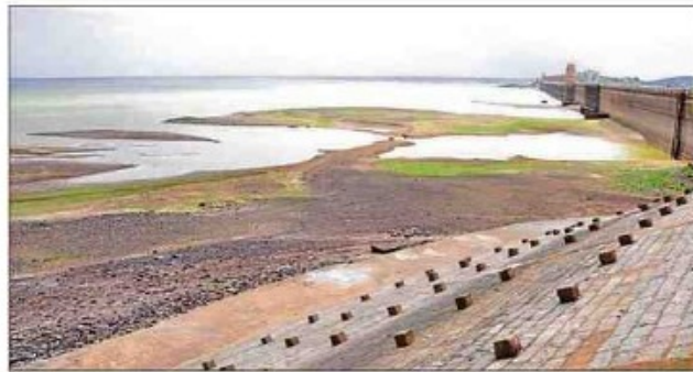
With just 4.84 tmcft water storage, the Tungabhadra dam in Hosapete taluk of Vijayanagara district has hit rock bottom.

The temple dedicated to Lord Shiva is said to have been constructed by Balapajja Mareguddi with the permission of Sangli rulers, two centuries ago. In 1970s, the temple went underwater after the construction of Hipparagi barrage. The temple resurfaces when the barrage and the river go dry.