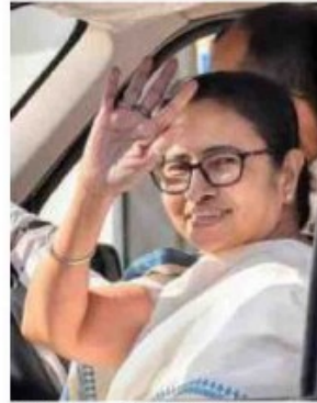
West Bengal Chief Minister Mamata Banerjee. FILE PHOTO

“In fact, the extent of erosion is so severe that the distance between the Ganga and Fulhar, has come down to only 1.5 km at Billaimari of Manichak block in Malda district, from its earlier distance of 4.0 km recorded in 2004, thus posing serious threats