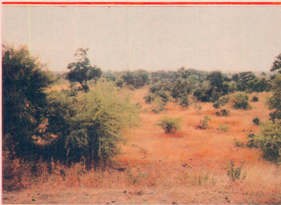
Wan Reservoir Project (Maharashtra) - Compensatory Afforestation