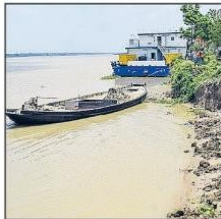
A boat caught by villagers at Balirchar. (Abhi Ghosh)

On Wednesday, villagers chased the boats laden with illegally extracted soil. The men in boats jumped in the river and swam off to escape. Villagers sank one boat in anger. They pulled another ashore