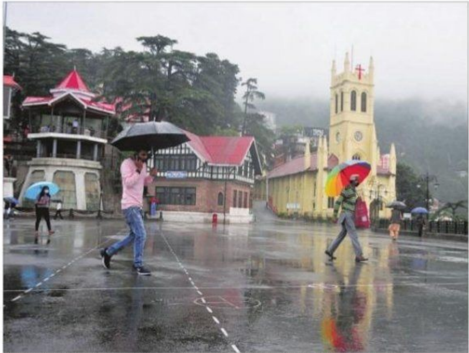
Commuters walk with umbrellas amid rain in Shimla on Wednesday.

The rain brought down temperatures; Una was the hottest with 32°C while Shimla and Keylong recorded 22°C degree and 19.8°C. The MeT office has issued a yellow alert of heavy rainfall, thunderstorm, lightning and gusty winds blowing with a speed of 30 to 40 kmph at isolated places in middle hills tomorrow and predicted rain and thunder-showers in mid and lower hills over the next six days from tomorrow.