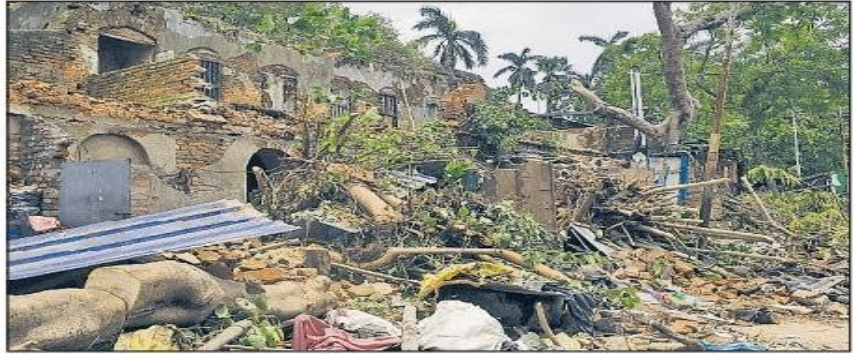
Destruction caused by Cyclone Amphan at Serampore in Hooghly district. File picture

On May 29, the chief minister had announced a Rs 6,800 crore compensation package for people who had suffered