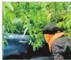
A car trapped under an uprooted tree in Palampur.

The police diverted traffic through Palampur town. Long queues of vehicles were seen in the congested markets of the town. Power supply and telecommunication lines were also damaged, resulting in a power