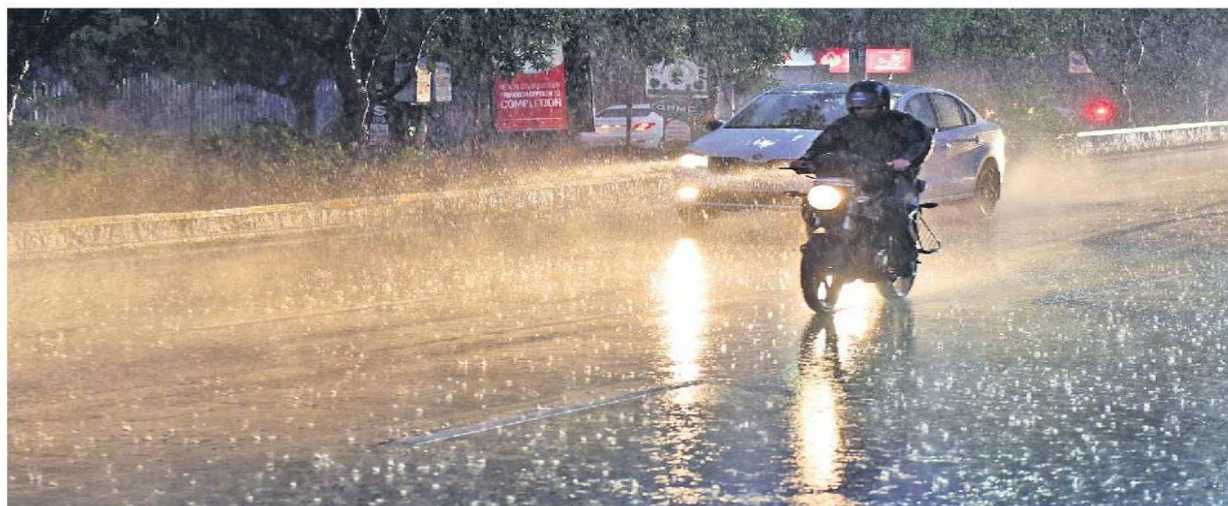
Hyderabad is likely to receive light to moderate rainfall in the next three days.

Against normal rainfall of 69.6mm for the month, city records 146.8 mm