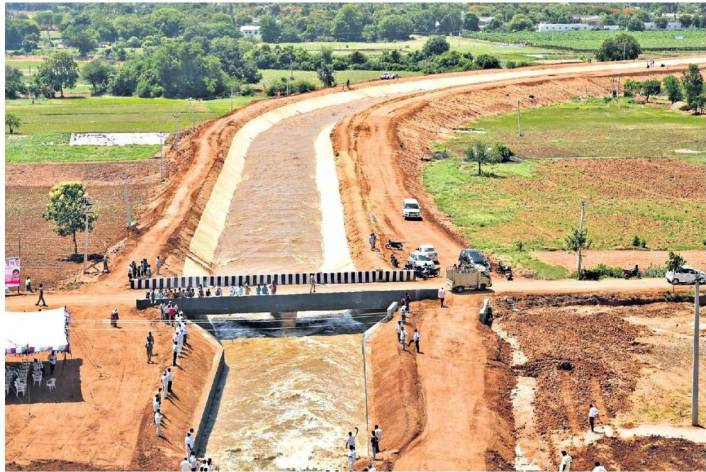
Water being released into the canal from Kondapochamma Sagar at Markook in Siddipet district on Wednesday.

The water is being pumped into the project lifting from Ranganayaka Sagar. Government has planned to impound 521 minor irrigation tanks in Siddipet and Yadadri-Bhongir districts with an aim to get over 60,000 acres under irrigation. During the first phase, the irrigation department has decided to fill 37 irrigation tanks in these two districts. Chief Minister K Chandrababtu Naidu had released the water to Kondapochamma Sagar by switching on lift irrigation pumps at Markook and Akkaram Pump houses on May 29. Gongidi Sunitha has said that people of her district would be grateful for Chief Minister since he had realised their dream in a short time.