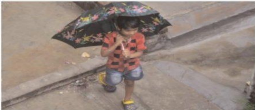
A boy during rain in the Capital on Wednesday.

The Met department also predicted heavy rainfall at isolated places in the national capital on Thursday. Normally, the wind system reaches Delhi on June 27.