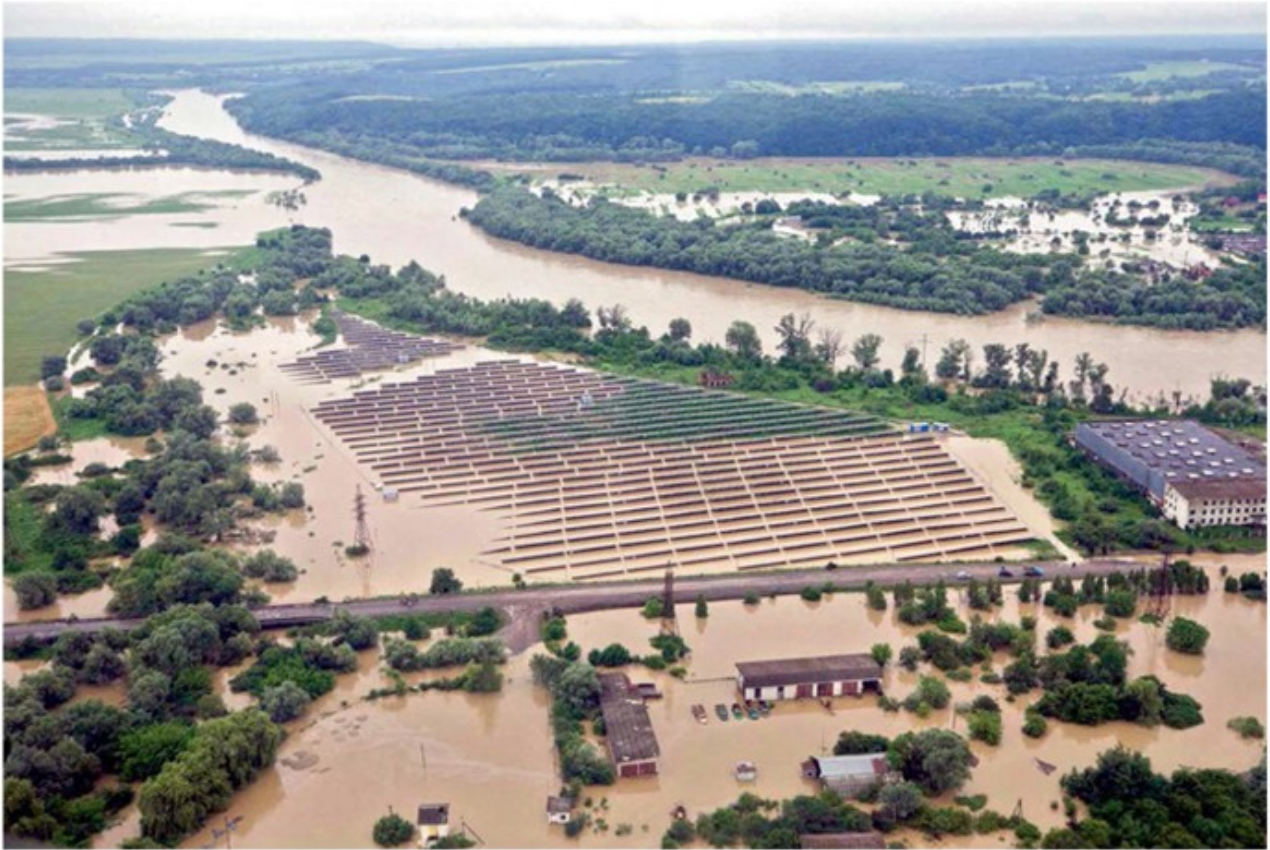
An aerial view of the flooded villages in the Ivano-Frankivsk region of western Ukraine, on Wednesday. Some 200 villages in the Carpathian mountains were flooded after heavy rains.