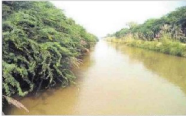
The supply of water in the canal has been reduced to 1,600 cusecs.

The Gang canal is one of the oldest irrigation systems in Rajasthan. It was built in 1928 to supply water to the northwestern part of Sriganagar, and discharges 2,500 cusecs of water.