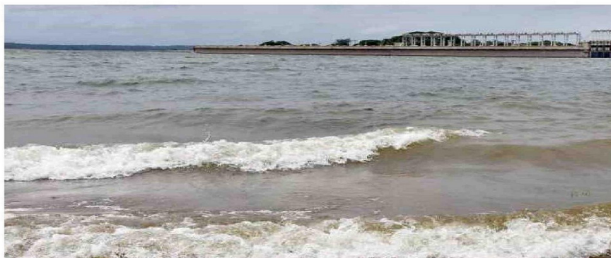
Copious flow: The realisation comes amid reports of the river being in spate in parts of the catchment in Karnataka during the last few days.

Cauvery Water Management Authority will hold a meeting on July 24. The situation has improved since the meeting of the CWRC on July 11