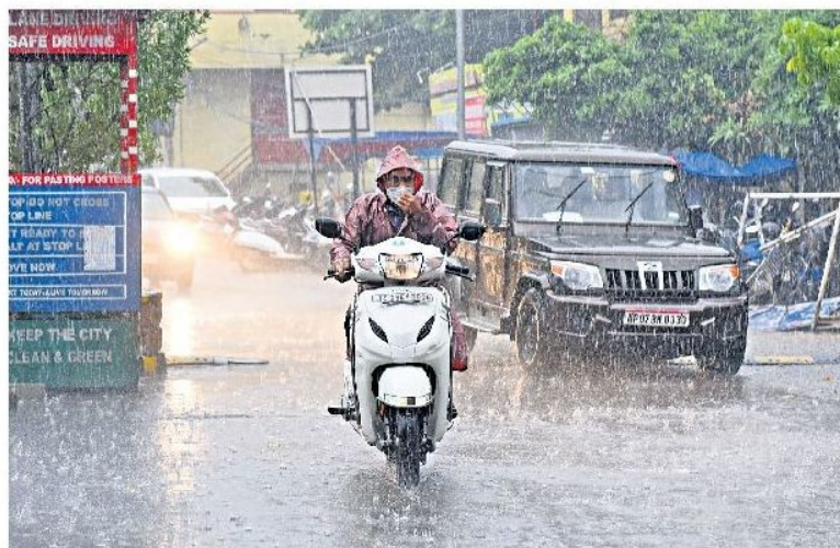
RAINFALL IN LAST TEN DAYS OF JULY (In Hyderabad)

As of July 20, Hyderabad received 359.5 mm average rainfall during this monsoon season, whereas the normal rain expected till now was 210.9 mm. According to officials, Hyderabad recorded at least 70.5 per cent excess rainfall compared to the rainfall estimated for the pe-