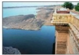
A file photo of KRS dam

Asked to clarify whether the government had stopped releasing water to Tamil Nadu, the CM said: "We cannot