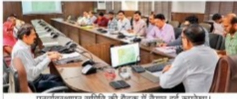
पुनर्व्यवस्थापन समिति की बैठक में तैयार हुई रूपरेखा।

विस्थापित परिवार को प्रधानमंत्री आवास योजना से न्यूनतम 50 वर्गमीटर का नवनिर्मित मकान व प्रतिमाह तीन हजार रुपये जीवन निर्वहन भत्ता दिए जाने की योजना है। अमानगंज के रामपुर गांव में इसके लिए जमीन भी आवंटित कर दी गई है।