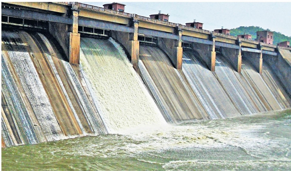
The Kaddam project, one of the oldest dams meeting irrigation and drinking water needs, irrigates 27,519 hectares in Adilabad district.