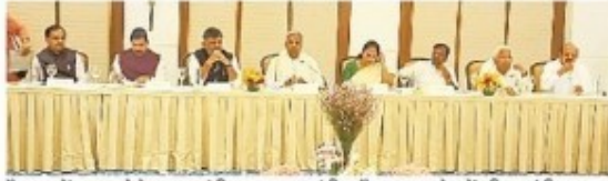
बैठक में भाग लेते मुख्यमंत्री, उपमुख्यमंत्री और राज्य के केंद्रीय मंत्री।

नई दिल्ली पहुंचे मुख्यमंत्री सिद्धरामय्या और उप मुख्यमंत्री डी.के. शिवकुमार ने बुधवार को