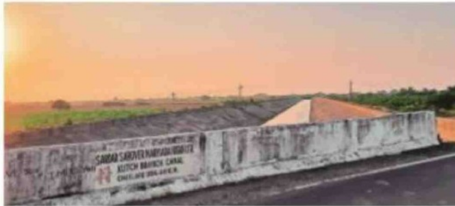
The last stretch of the 357-km Kutch Branch Canal of the Sardar Sarovar Project at Mod Kuba. Sourav Roy Barman

as water started flowing through the Narmada canal around midnight, the villagers rejoiced, breaking into loud cheers and