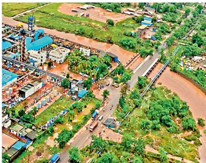
A view of the flood-hit areas in Raigarh district on Friday.

A senior DMU official said that landslides have taken place at three places in Raigad districts. Landslides were reported at two places in Poladpur taluka and one place in Mahad taluka in Raigad district. 43 people were killed in Raigad district and eight