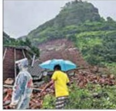
Locals at the site after several people died in a landslide at Taliye village in Satara district

The official put the death toll in various incidents in western Maharashtra's Satara district at 27. Other fatalities