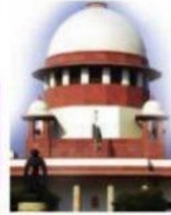
अदालत आए हैं।

न्यायमूर्ति एल नागेश्वर राव, न्यायमूर्ति एस