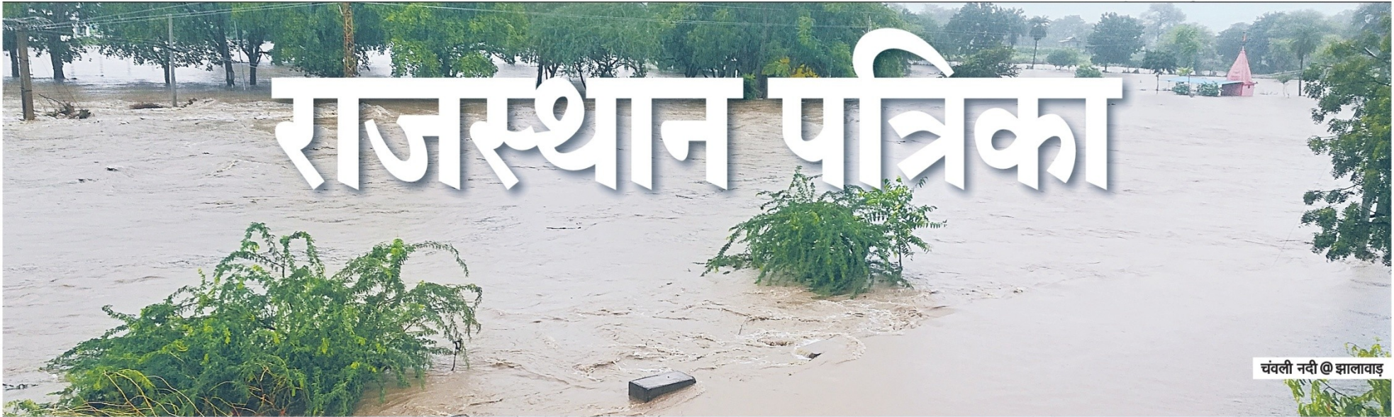
चंवली नदी @ झालावाड़