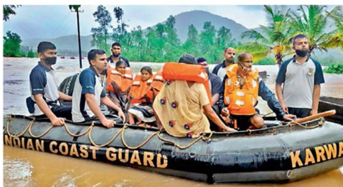
Indian Coast Guard (ICG) officers and Karnataka Disaster Response team during a rescue operation at a flooded area after heavy rain in Uttara Kannada district.

deaths reported and 24 feared trapped under debris in Satara district.