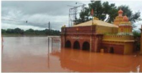
A view of the partially submerged Krishnamai temple in Karad on Friday.

» The water levels have receded but in hilly areas, roads and bridges have been washed away.