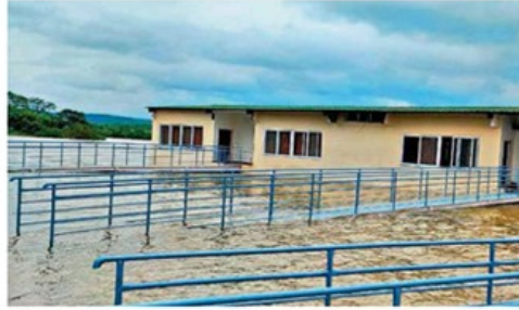
Heavy rain swamps buildings in Warangal, where the Godavari is running over bridges.

The Godavari is likely flood in Eturnagaram in Mulugu district. The Godavari inundated NH 163 at Pavuralavagu bridge in Wazeed of Mulugu district, cutting off the road link to Chhattisgarh.