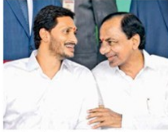
K. Chandrashekar Rao and Y.S. Jagan Mohan Reddy in happier times

Meanwhile, Union Jal Shakti minister Gajendra Singh Shekhawat is learnt