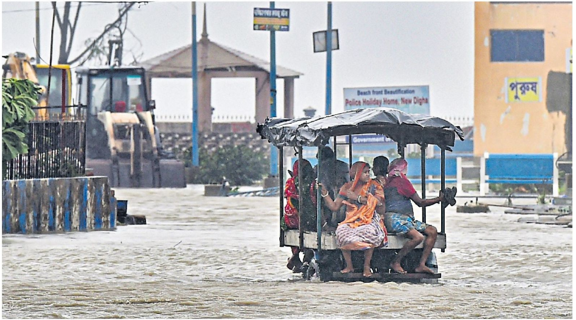
People take shelter on a cart as cyclone Yaas makes landfall, at Digha in East Midnapore district, on Wednesday

Patnaik also directed officials to repair all roads within 24 hours. As many as 605 roads