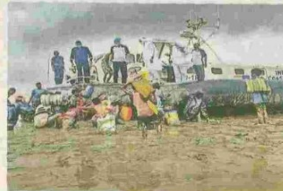
चक्रवात यास के कहर के बीच बुधवार को ओडिशा में समुद्र तटीय इलाके में मुश्किल में फंसे लोगों को निकालने के लिए भारतीय तटरक्षक बल ने राहत-बचाव अभियान चलाया

कोलकाता व आसपास आंशिक नुकसान: बंगाल में तटीय इलाकों में चक्रवात ने खासा उत्पात मचाया, लेकिन कोलकाता, हावड़ा, हुगली समेत कई जिले आंशिक रूप से प्रभावित हुए। मुख्यमंत्री ममता बनर्जी के अनुसार, 134 तटबंध टूट गए