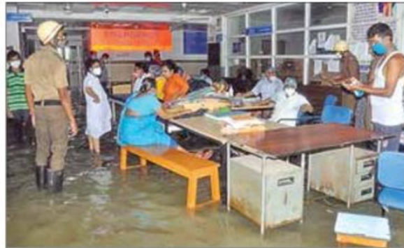
A flooded room of Kakdwip Hospital in South 24 Parganas, on Wednesday

However, the two state capitals Kolkata and Bhubaneswar were saved from the wrath of the cyclonic storm, though the two cities witnessed heavy rains and high winds.