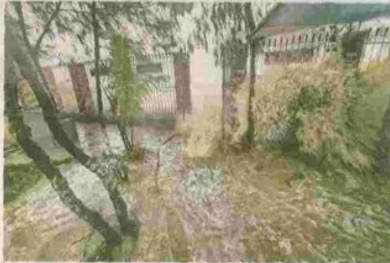
ओडिशा के बालासोर में बुधवार को समुद्र तटीय हिस्से से चक्रवात यास के टकराने के दौरान समुद्र का घानी घरो को अपने आगोश में लेता नजर आया