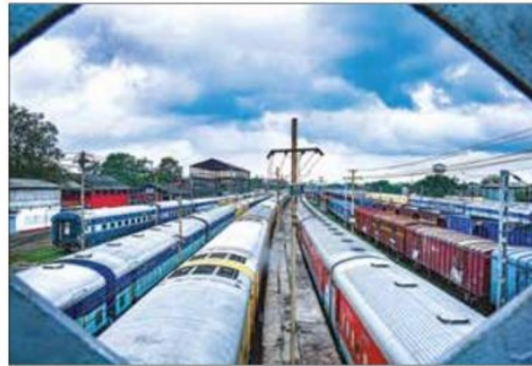
Dark clouds loom over trains at a railway yard ahead of cyclone Yaas, in Dhanbad, on Wednesday

"We have announced a complete lockdown today and tomorrow barring some relaxation for emergency cases and