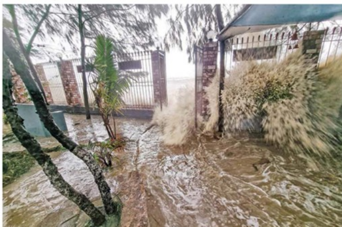
Sea water enters through boundaries of a house during the Cyclone Yaas' landfall in Chandipur area of Balasore on Wednesday.