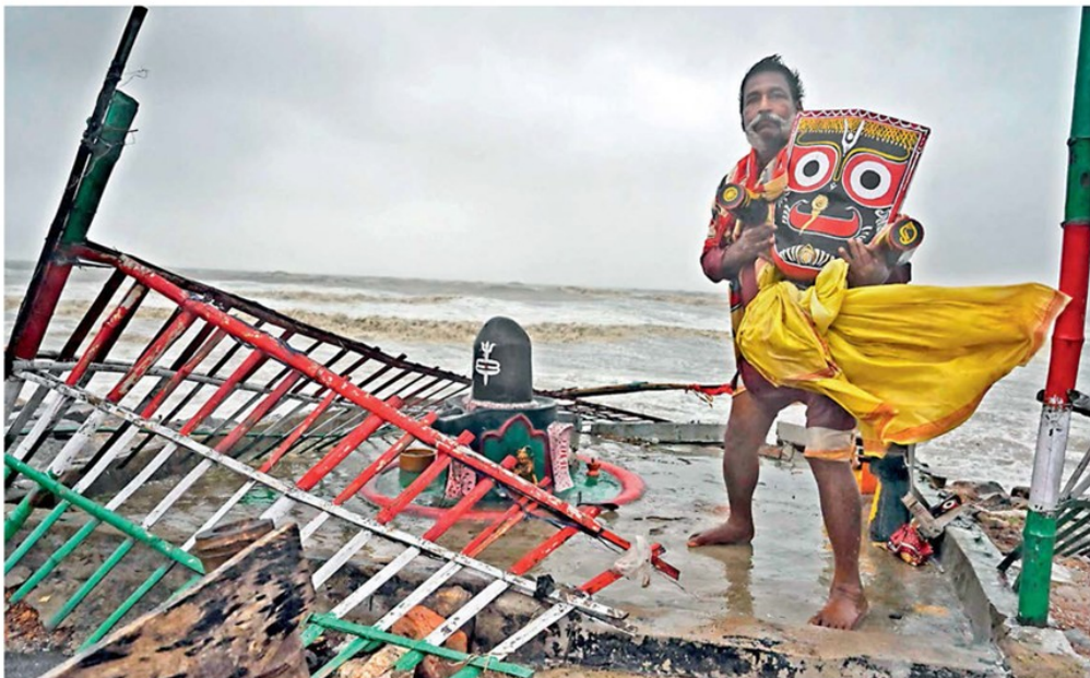
A priest shifts an idol of Lord Jagannath from a seafront temple to a safer place in Balasore district in Odisha as cyclone Yaas barrels towards eastern coast in the Bay of Bengal.

"During its landfall, Yaas had turned into a very severe cyclonic storm. It hit the coast at Bahanaga, 20 km south of Balasore town at 10.30 am and the landfall process continued for nearly three hours. With its impact, several coastal Odisha districts including Kendrapara, Bhadrak, Balasore and Jagatsinghpur received heavy rainfall ranging up to 150mm in the last 24