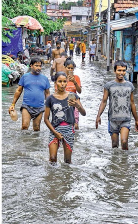
Pedestrians use their mobiles to capture the flooded road after the landfall of Cyclone Yaas, in Kolkata on Wednesday.