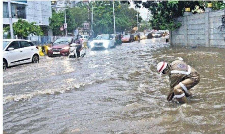
A traffic policeman tries to clear a water logging point near the RTA office at Somajiguda on Monday evening.

Meanwhile, Himayat Sagar is receiving 300 cusecs of inflow and water is being drained into Musi River through the gate, which was