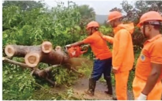
NDRF jawans clear a road in Malkangiri district.