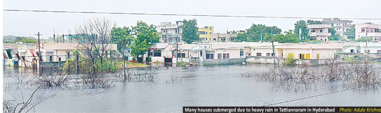
Many houses submerged due to heavy rain in Tattinnaram in Hyderabad

Meanwhile, the government has announced that all engineering and degree