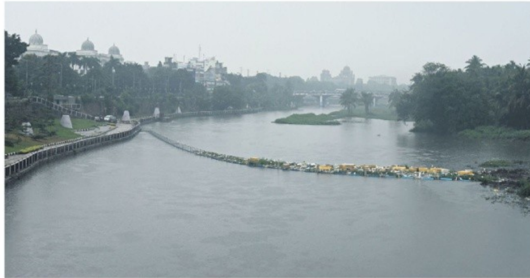
River Musi overflowing following heavy rains that lashed the city. By 7.30 pm on Monday, the city on an average received about 36 mm of rainfall, according to IMD.

According to IMD forecast, the cyclonic activities in the Bay of Bengal have intensified due to which depression has formed over Telangana and adjoining areas. Director, IMD, Hyderabad, Dr K Nagarajna said, "Telangana districts are likely to witness heavy to very heavy rains, while few districts might experience extremely heavy rain. The rainfall will be accompanied by winds of 30-40 kmph. Hyderabad is likely to witness heavy to very heavy rainfall with thunder and lightning, for which we have issued orange warning. There can be spells of heavy rainfall in the city. The depression is likely to weaken in the next 24 hours."