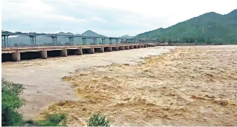
The water level rises in Gotta barrage at Andhra Pradesh-Odisha border due to heavy rainfall, on Monday.

Agricultural and horticultural crops in over 1.63 lakh acres suffered damaged due to the heavy downpour in Srikakulam, Vizianagaram, Visakhapatnam, East Godavari, West Godavari and Krishna districts, Agriculture Minister K Kanna Babu