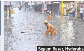
Begum Bazar, Hyderabad

floodwaters and people faced severe problems in many municipalities like Khammam, Kothagudem,