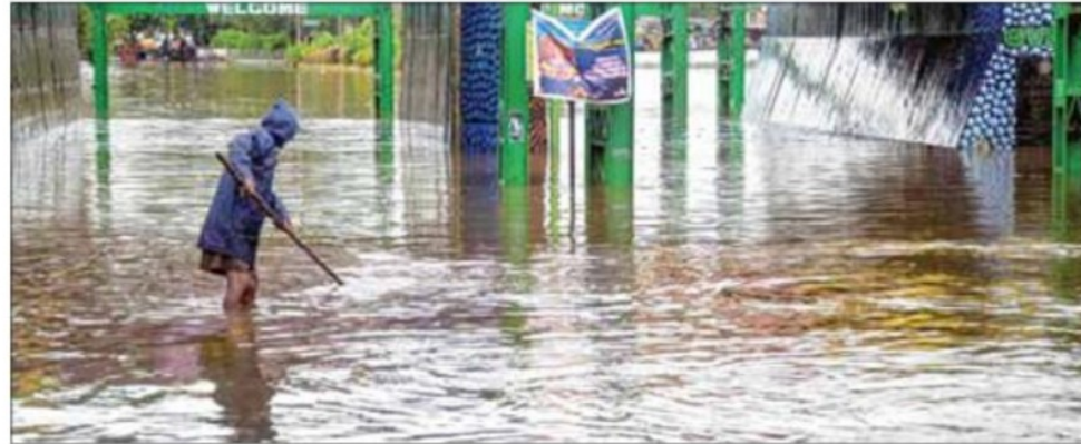
View of flood affected area following heavy rains induced by Cyclone Gulab in Visakhapatnam on Monday

On Sunday, a fisherman was killed in the cyclonic storm in Bay of Bengal in Srikakulam district. Chief Minister Y S Jagan Mohan Reddy reviewed the situation with Collectors of the rain-affected districts and directed them to step up relief works. The Chief Minister announced an ex-gratia relief of Rs 5 lakh each to the kin of those killed in