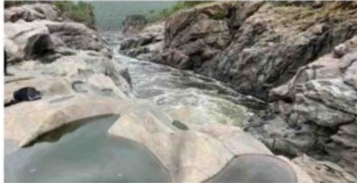
Following Tamil Nadu's objection to the proposal to build a dam at Mekedatu, the issue was not taken on agenda during meetings of Cauvery Water Management Authority held this year.