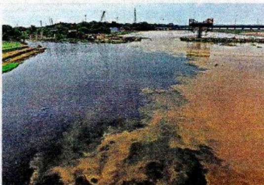
सिग्नेचर ब्रिज के समीप यमुना से कचरा तो साफ हो गया, लेकिन नजफगढ़ से आ रहे केमिकलयुक्त पानी से यमुना गंदी ही नजर आ रही है

● 30 जून तक उल्लेखनीय सुधार का दावा किया था, छह माह की कार्ययोजना भी बनाई थी