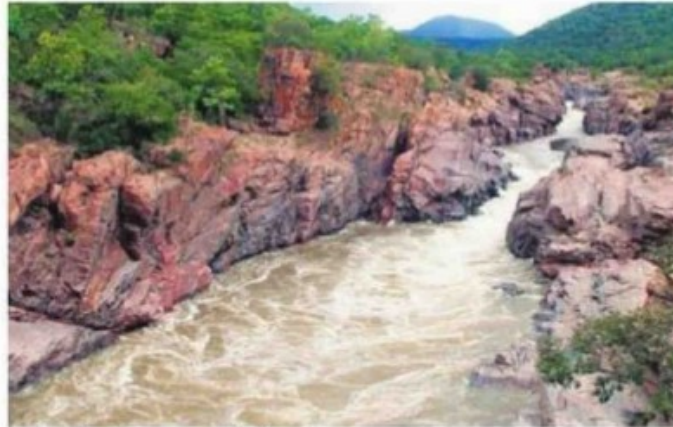
A view of river Cauvery at Mekedatu | FILE PHOTO

Meanwhile, the minister, in a statement issued in Chennai on Monday, said the Karnataka government's plan to build a dam at Mekedatu is against the verdict of the Supreme Court and the Union Jal Sakthi ministry has repeatedly said the approval for the project will not be given without the consent of Tamil Nadu. He also pointed out that cases filed by Tamil Nadu are pending before the