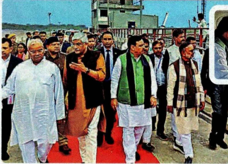
कोटा . केंद्रीय मंत्री गजेन्द्र सिंह और सीएम भजनलाल शर्मा निर्माणाधीन नवनेरा एबरा डेम का निरीक्षण करते हुए।