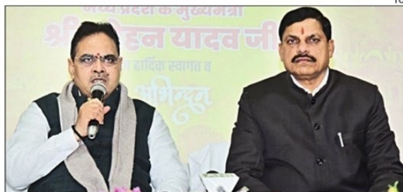
File pic of CM Bhajan Lal Sharma with Madhya Pradesh CM Mohan Yadav addressing a presser after signing the MoU on PKC-ERCP project

He slammed the leader of opposition in the Rajasthan assembly and Congress lea-