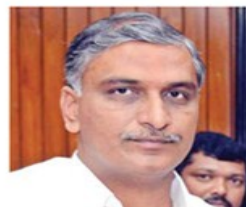
T. Harish Rao

Addressing the media, Harish Rao stated that Revanth Reddy, despite his earlier commitment to refrain from personal attacks, had challenged him to discuss the projects' handover issue in