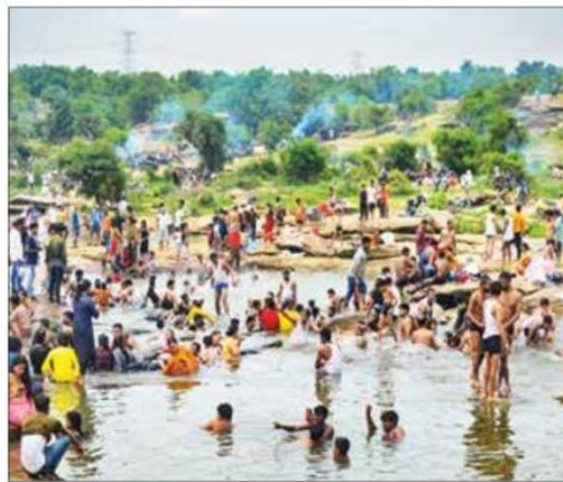
People bathe at Kharanja waterfall following monsoon rains in Mirzapur on Sunday

After a good spell of rains in the first two and half weeks of June, the Southwest Monsoon has not advanced further since June 19.