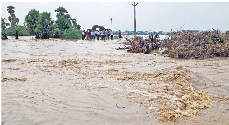
Water gushing out of Poloni Vagu following heavy rains at areas under the Ieeja municipality in Jogulamba Gadwal district on Monday.

According to Telangana State Development Planning Society (TSDPS), the period from June to Sep-