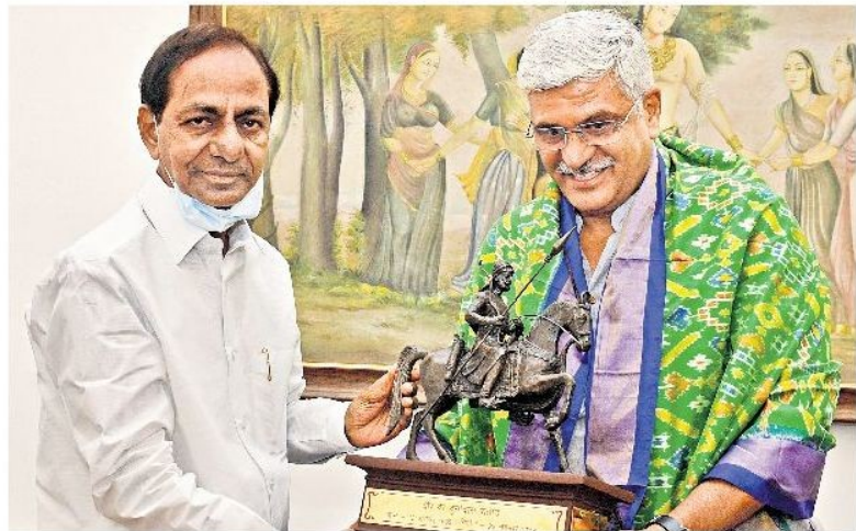
Chief Minister K Chandrashekhara Rao with Union Minister for Jal Shakti Gajendra Singh Shekhawat, in New Delhi on Monday.

The Chief Minister requested the Union Minister to issue necessary directions to the Godavari River Management Board and CWC for immediate action