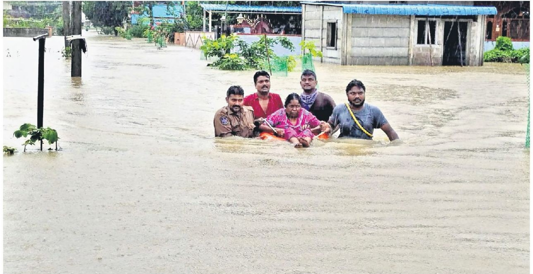
An elderly woman being carried to safety from a flooded locality following heavy rain, in Khammam district on Monday.

At least three persons were washed away in separate incidents in Kothagudem and Warangal. In Jayamma Colony at Palon-