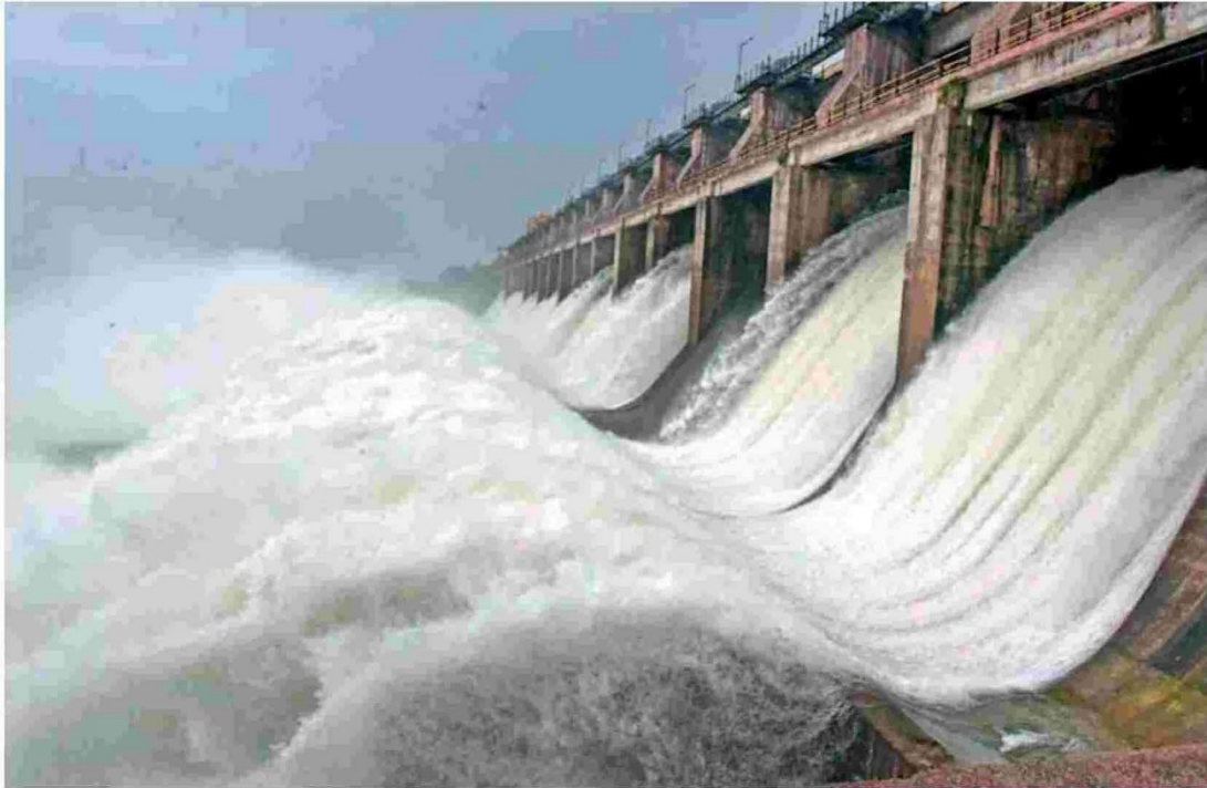
16 gates of Lower Manair Dam in Karimnagar being lifted on Monday due to heavy rainfall.