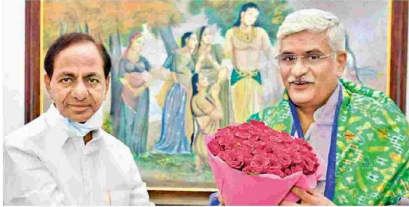
Chief Minister K. Chandrashekar Rao meets union Jal Shakti minister Gajendra Singh Shekhawat in Delhi on Sunday.

Rao informed Shekhawat that these 11 projects were started