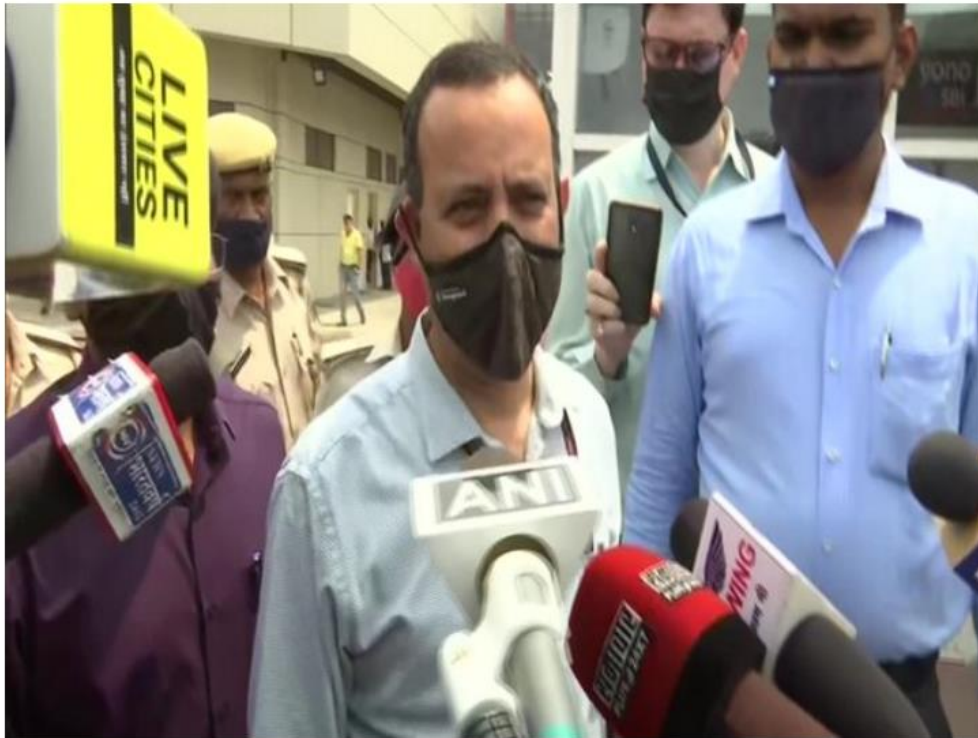
Central team reaching Bihar