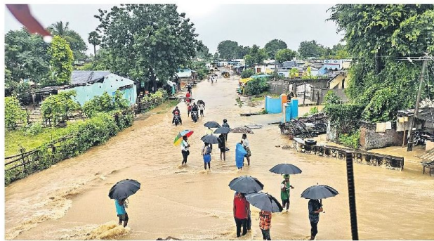
People walk through a flooded stretch in Khammam. (Above) A swollen river.

Similarly, transportation was affected at several places as overflowing streams flooded the roads, at Burgampad, Julurpad, Aswapuram and other places. Coal production was affected in SCLL opencast mines at Kothagudem, Yellandu, Manugur and Sathupalli. Meanwhile, officials lifted five gates of Kinnerasani reservoir at Paloncha to release 26, 000 cusecs of excess water. At Cherla, three gates of Taliperu project were lifted to release 3,632 cusecs of water and villagers downstream were alerted.