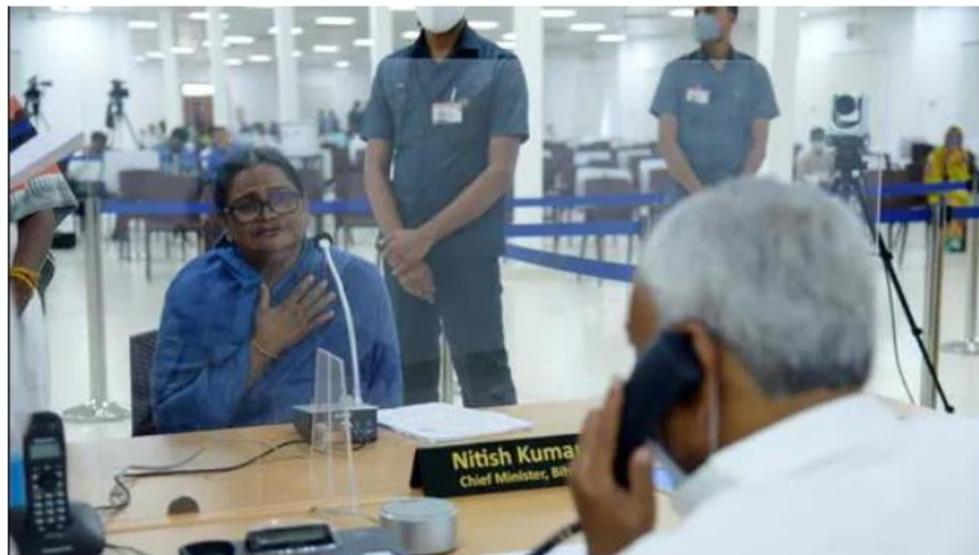
Bihar Chief Minister Nitish Kumar during Janata Darbar in Patna on Monday.

Bihar chief minister Nitish Kumar on Monday said that the water resources department (WRD) has been carrying out studies about the scope of interlinking of small rivers to minimise the scale of devastation due to recurring floods.