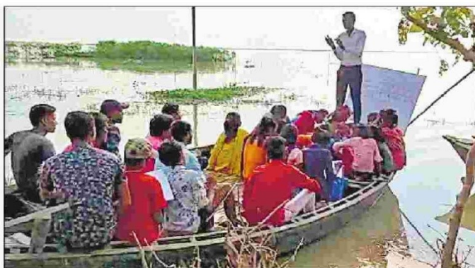
बिहार के कटिहार जिले के मनहारी क्षेत्र में सोमवार को एक नाव पर पाठशाला लगाकर बच्चों को पढ़ाता शिक्षक।

20 हजार हेक्टेयर से अधिक फसल नष्ट हुई गोरखपुर जिले में