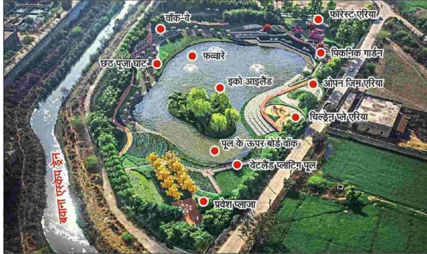
बवाना की सनोथ झील को रिवाइव करने के लिए घोघा ड्रेन के प्राकृतिक एसटीपी का पानी किया जाएगा इस्तेमाल

छह एकड़ में फैली सनोथ झील बवाना के सनोथ गांव में स्थित है। बवाना कॉमन एफ्लुएंट ट्रीटमेंट प्लांट (सीईटीपी) से लगभग 3 एमजीडी पानी को रिसाइकल करके सनोथ झील को जीवंत करने के लिए इस्तेमाल में लाया जाएगा। इस झील में बच्चों के लिए खेल का मैदान, पिकनिक गार्डन, पैदल मार्ग, छठ पूजा घाट और जिम