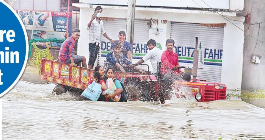
Women with essentials flee from their flooded homes to safer location, in Warangal on Tuesday