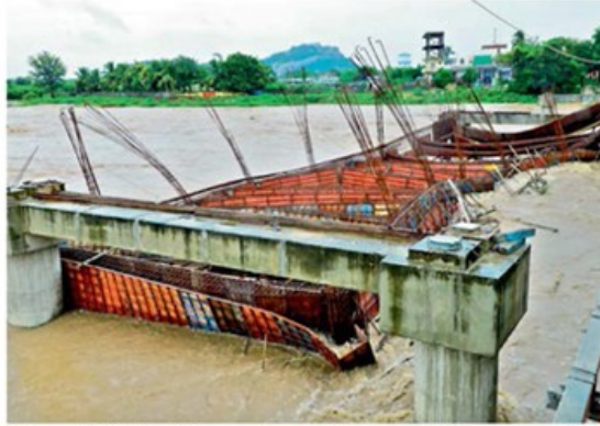
The scaffolding of an underconstruction bridge across the Mulavagu canal collapsed due to heavy rains at Vemulawada in Rajanna Sircilla district on Tuesday.

Sircilla town was flooded due to heavy rains. The newly-inaugurated integrated collectorate complex was inundated. Several localities in the town were submerged in the flood. Cars and two wheelers were washed away in flood water.