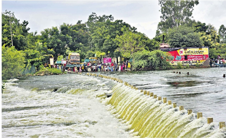
People stranded at Katakshapur following heavy rain in Atmakur mandal of Hanamkonda on Tuesday.