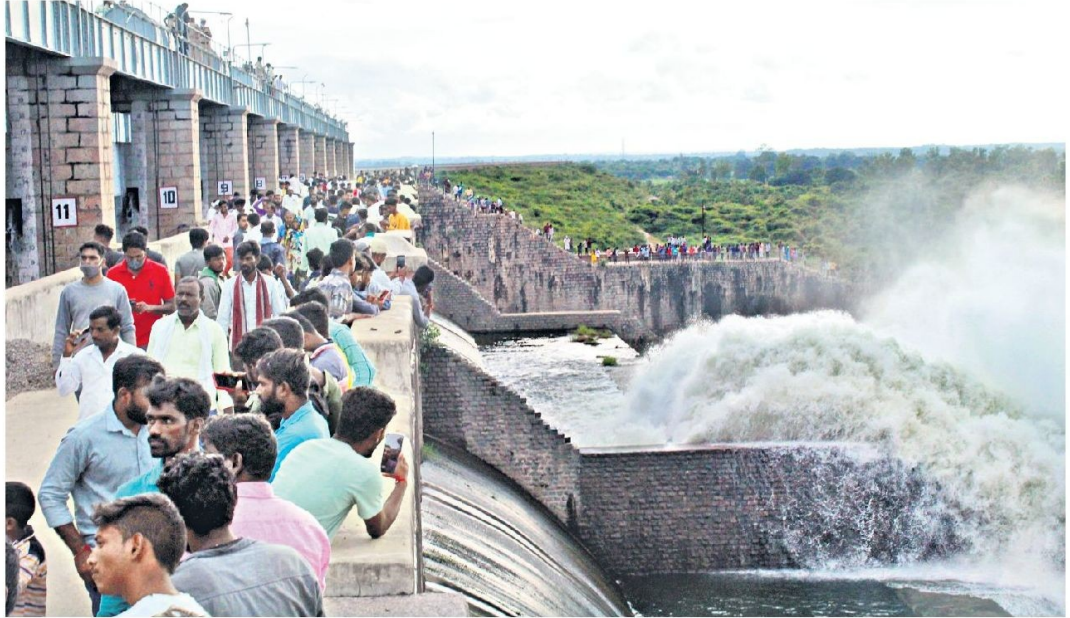
Water being released from Nizamsagar project following heavy rains, in Nizamabad on Tuesday.

was receiving 2,400 cusecs of inflows from Singur Dam, Pocharam and Haladi Vagu. Eighteen gates each of Mid Manair reservoir and Lower