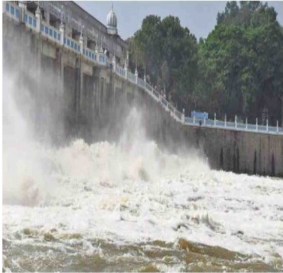
Managing storage: The combined storage of the reservoirs, including Poondi, stands at 10,582 million cubic feet (mcft) against their capacity of 11,757 mcft.

Kosasthalaiyar water to be diverted to flush polluted stretch of the Cooum