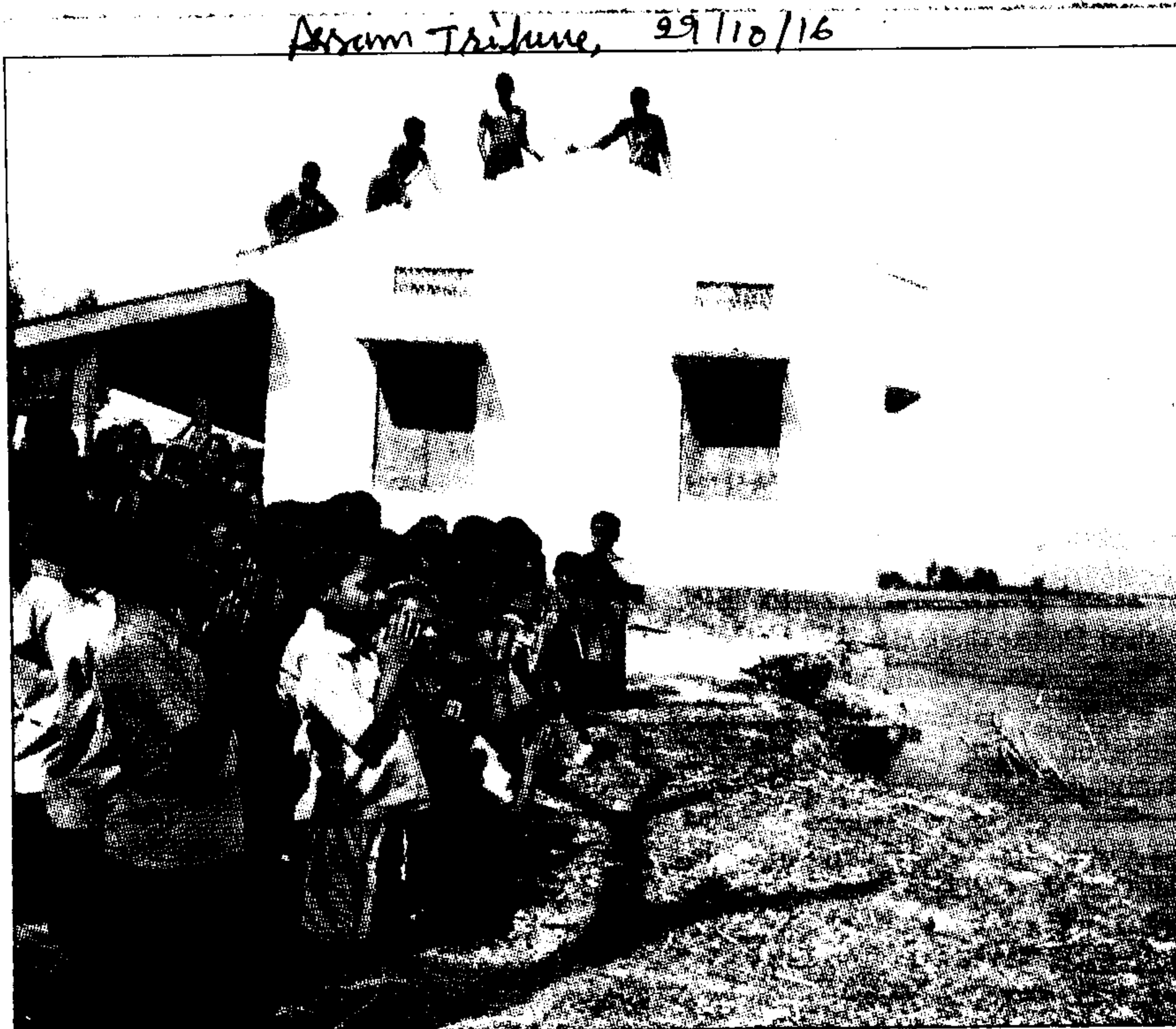
Students of erosion-hit No. 30 Bhoroli Chapori LP School offering prayers to Jia Bharali river, at Mansri near Tezpur on Friday.

The Deccan Herald ( Bengluru ) The Deccan Chronical ( Hyderabad ) Central Chronical ( Bhopal )