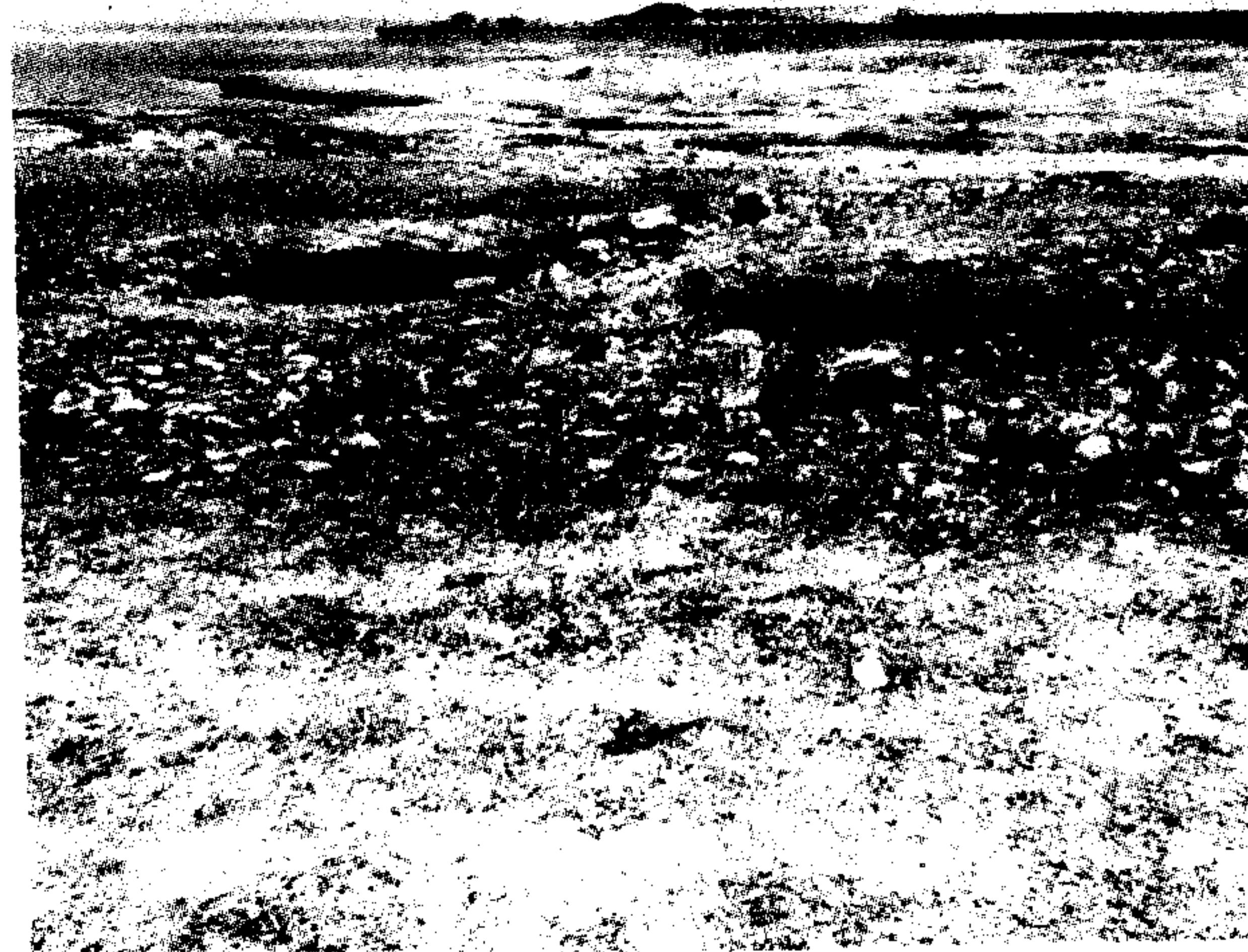
BLEAK SCENARIO: Bengaluru, Mysuru, Mandya and other areas are dependent on the KRS.

The "live storage" in the reservoir was 0.762 tmcft at 6 a.m. on Sunday as against the