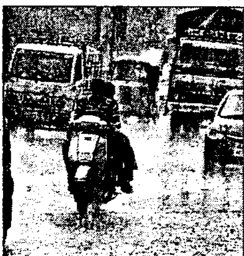
Drought-hit Kerala(L) and flooded streets of Tamil Nadu

deficit of 34 per cent rainfall and even if the state received 90 to 100 per cent rainfall in November and December, it was projected that the state would have a deficit of 69 per cent rain-