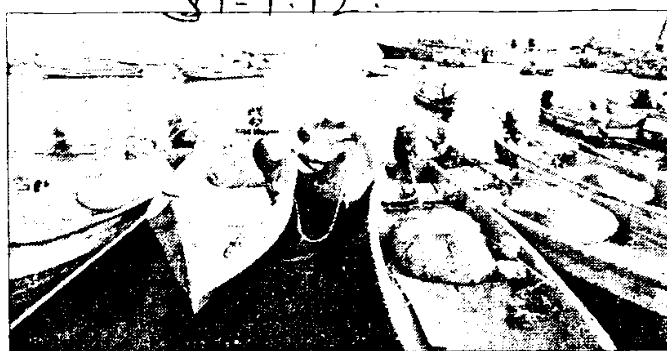
Indian fishermen anchor at a harbour in Chennai.

The IMD statement issued on Wednesday afternoon said that "as predicted, the