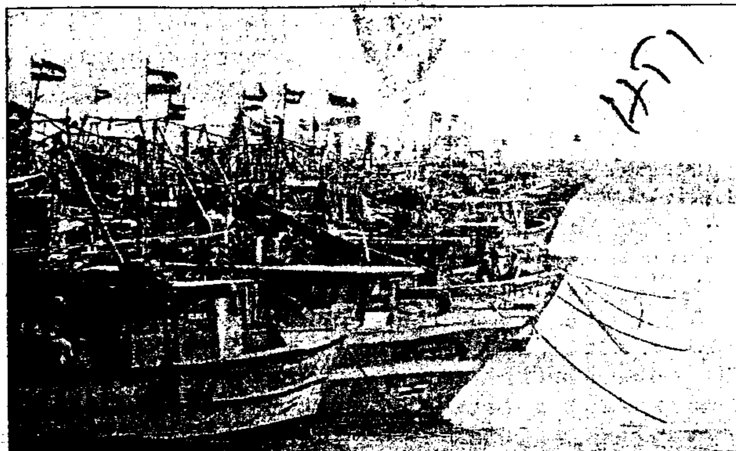
■ Fishermen anchor in a harbour in Chennai on Wednesday. Cyclone Nada is expected to make a landfall between Vedaranyam and Puducherry near Cuddalore on Friday.

“Wind speeds of 45-55 kmph could lash through Cuddalore, Karaikal and Puducherry when