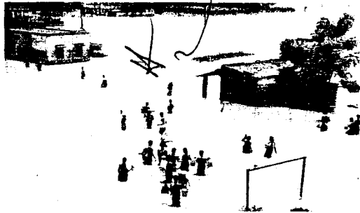
Deep trouble: People collecting flood relief materials in Udaynarayanpur in West Bengal on Tuesday.

Landslides across Himachal Pradesh following torrential rains left several small and big link roads blocked and disrupted traffic on the Hindustan-Tibet road. A worker from Nepal was