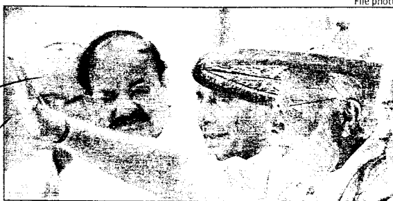
Prime Minister Modi also announced setting up of a committee to find a solution to the problem of recurrent floods in the region

Modi also announced setting up of a committee to