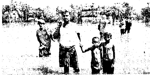
Problems aplenty: People braving flood water in Sehagori village in Howrah district on Monday.

In Odisha, deaths caused by lightning have risen to 34,