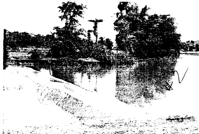
Anicut built under the Jal Swavalamban Abhiyan in Rajasthan for regulating the flow of water.