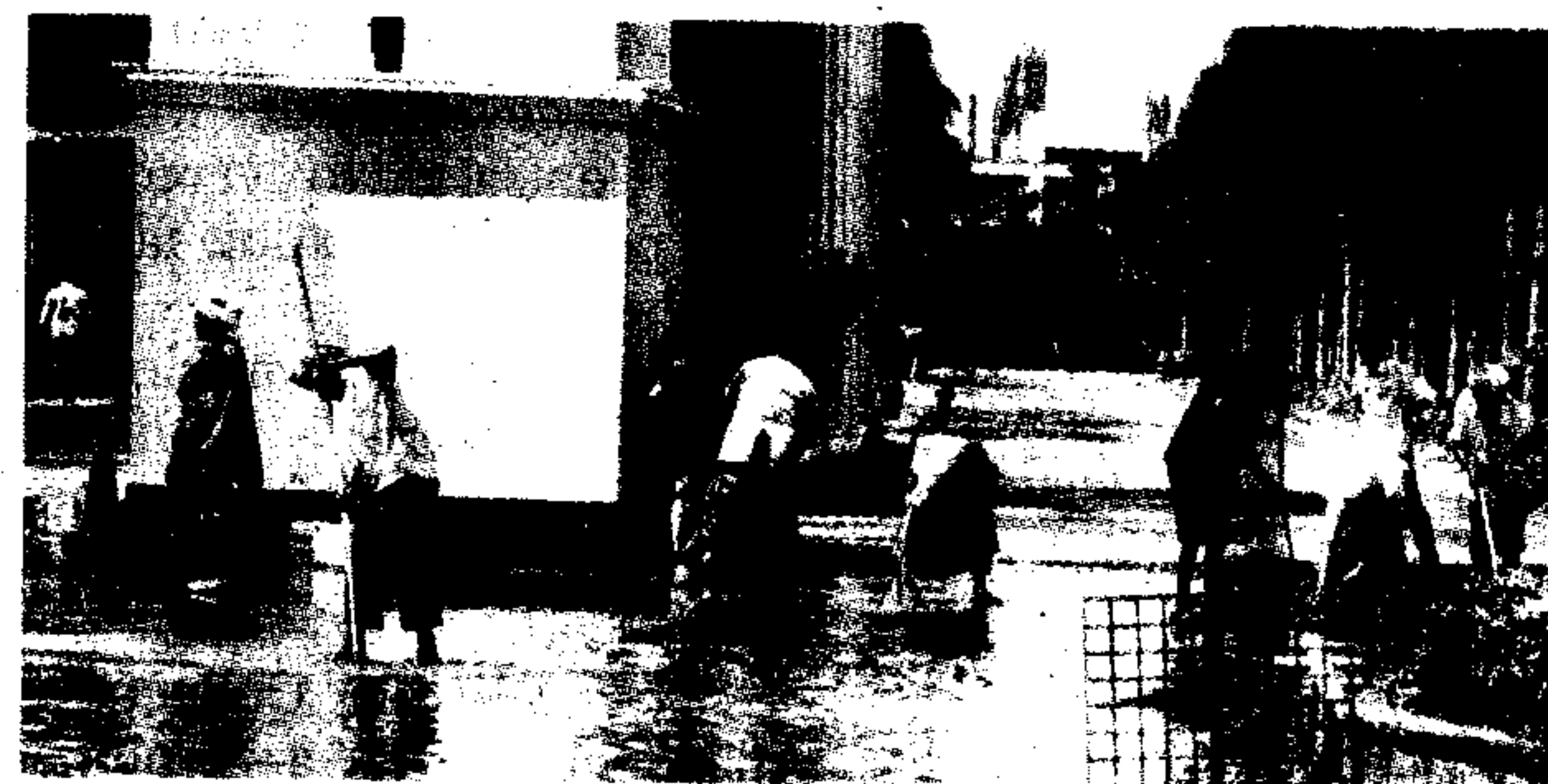
Chennai will receive light or moderate rain up to 4 cm till Wednesday.

"We can expect fairly widespread rain over southern and interior parts of the State. One or two places may even get heavy rainfall of up to 12 cm till Wednesday. However, those in the north coastal region may have rel-