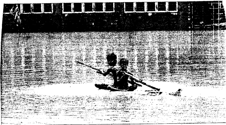
Boys row a makeshift raft at a flooded village in Howrah district, West Bengal, on Wednesday.

and documented at Bhagirath(English)& Publicity Section..CWC