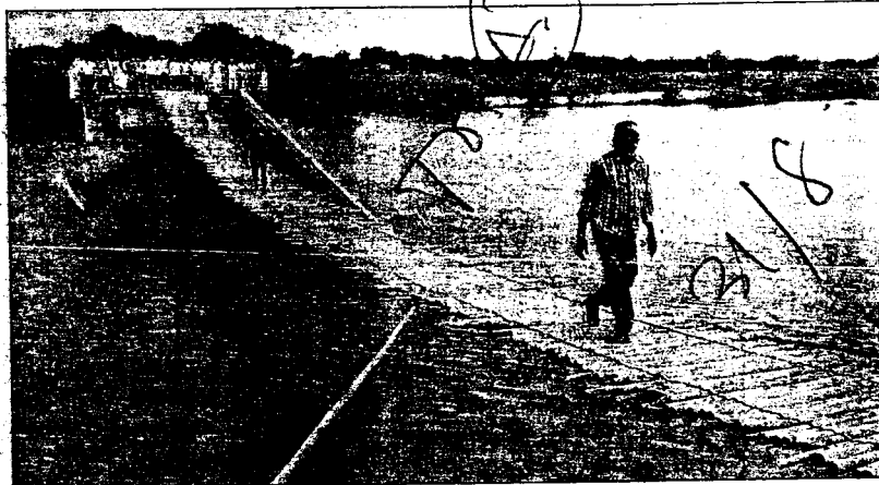
Man walks through a rickety hanging bridge that was damaged due to rains near Botad

Several areas in Khambhaliya town were in knee-deep waters and the highway connecting to temple town Dwarka was also inundated.