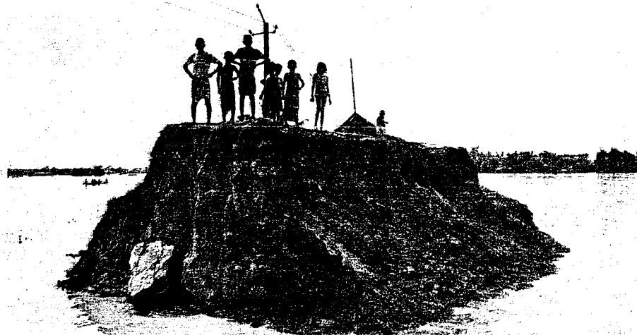
Flood-affected villagers waiting for relief material on a washed away road in Assam.

The third wave of devastating flood has so far claimed the lives of 74 people across the State. With these, the flood toll in Assam went up