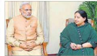
■ Prime Minister Narendra Modi with Tamil Nadu chief minister J. Jayalitha in Chennai on Thursday.