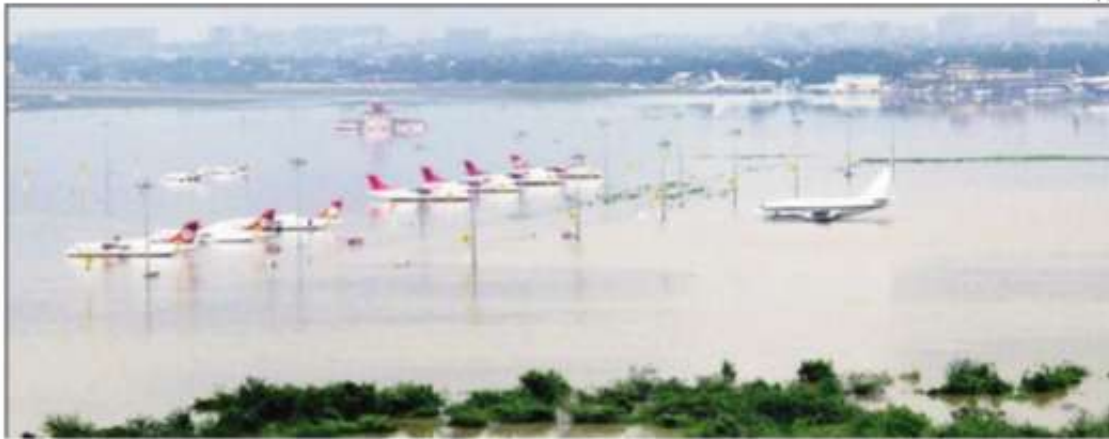
TOUCH DOWN: An aerial view of the Chennai airport which shut operations after Wednesday's showers

A photo of Prime Minister Narendra Modi surveying parts of rain-hit Chennai on Thursday. (R) An apparently photoshopped image released by Press Information Bureau, which PIB was forced to remove after questions were raised in the social media about its authenticity