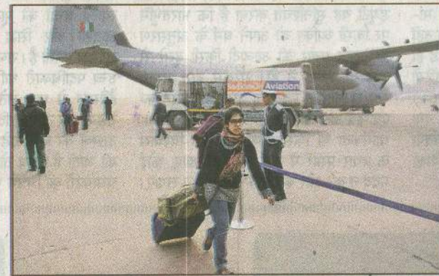
एयरपोर्ट पर फंसे लोगों को एयरफोर्स के विमान बाहर निकाल रहे हैं।

चेन्नै के बाढ़ प्रभावित इलाके में पीएम मोदी की एरियल विजिट की इस फोटो पर सोशल मीडिया में सवाल उठ रहे हैं। कहा जा रहा है कि विमान से बाढ़ में डूबे इलाके इतने करीब कैसे दिख सकते हैं। इसे फोटोशॉप का कमाल बताया जा रहा है। (विस)