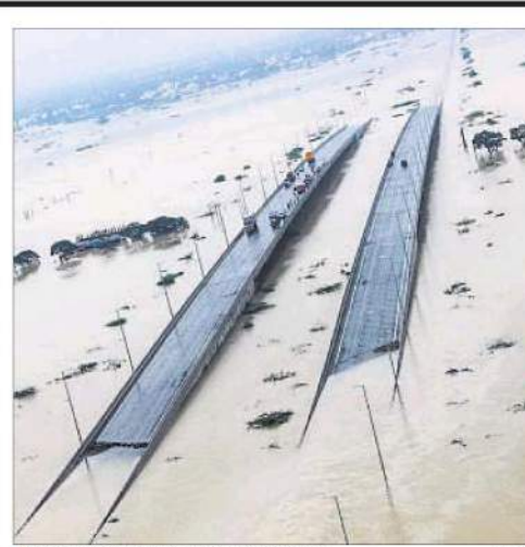
■ An aerial view of a flooded area near Chennai in Tamil Nadu.

City officials said the corporation rescued 62,000 people while the fire department evacuated another 5,000 but sporadic electricity supply and clogged telephone lines hit operations.