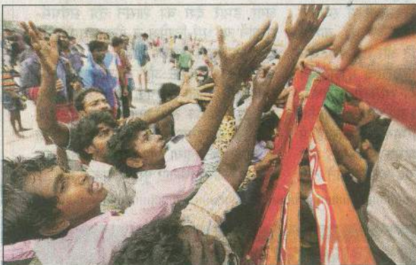
बाढ़ से बेघर लोगों को अब बाहरी मदद का ही सहारा है।