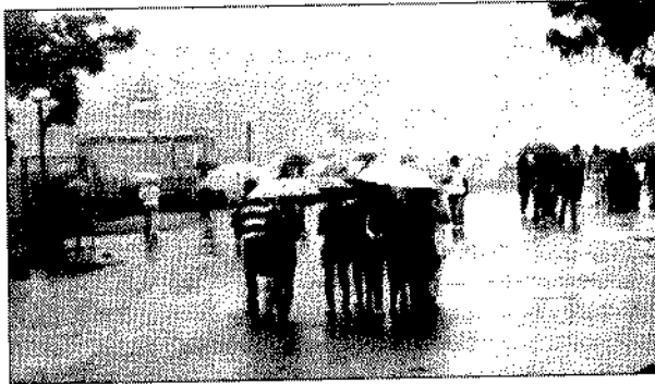
Visitors enjoy heavy rainfall in Shimla on Sunday.

The maximum day temperatures fluctuated marginally