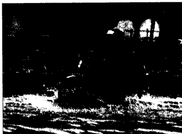
A biker wades through a waterlogged street in Guwahati.