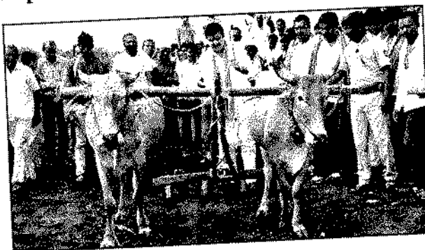
Maharashtra MoS for Revenue Sanjay Rathod works in a field in Yavatmal district of Vidarbha.

Speaking to The Sunday, Rathod said he wanted to do something on July 1, observed as Krishi Din (Agriculture Day) in Maharashtra, and thought it