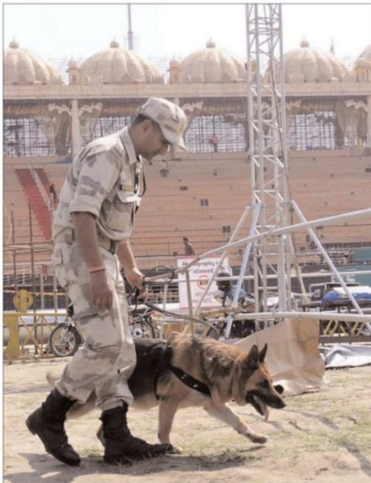
ITBP dog squad team inspecting the visitors area as workers prepare the stage for the three-day World Peace Festival organised by spiritual guru Sri Sri Ravi Shankar. In the Capital on Wednesday.