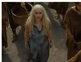
New trailer of 'Game of Thrones' season 6 out 09/03/2016