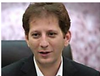
Iran billionaire sentenced to death 07/03/2016