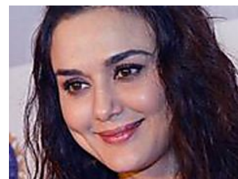
Preity Zinta gets married to beau in Los Angeles? 02/03/2016